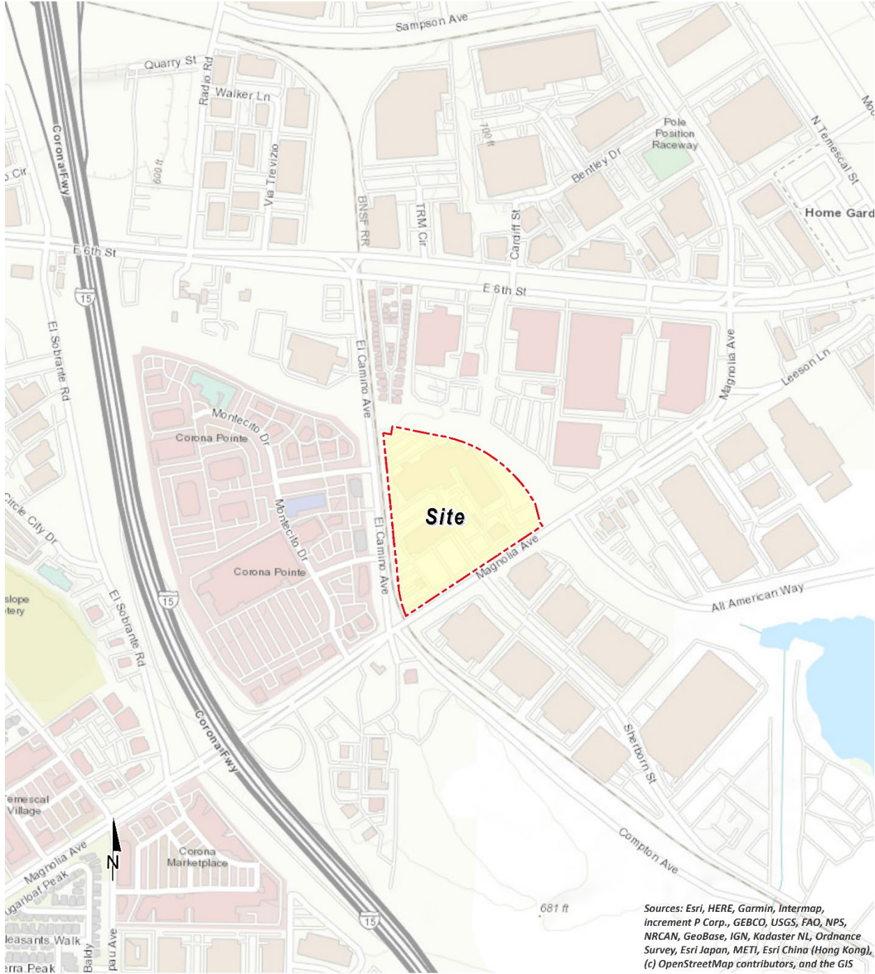
EXHIBIT 1-A: LOCATION MAP