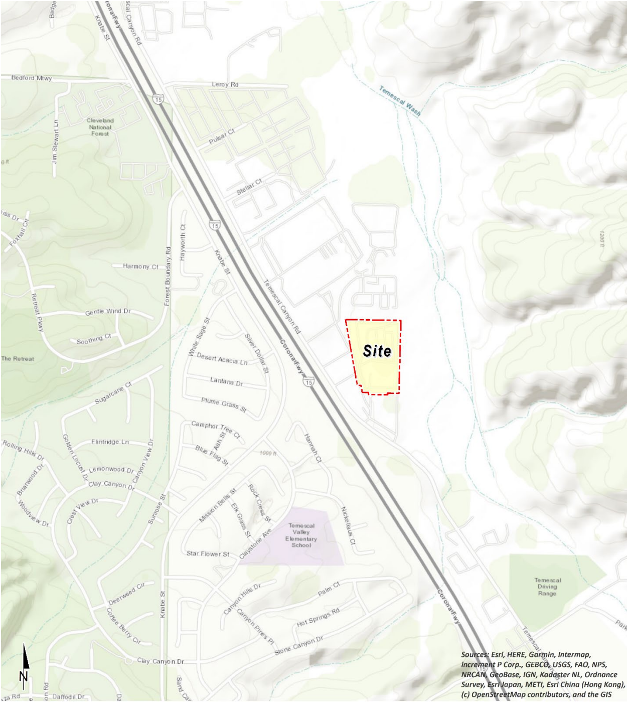
EXHIBIT 1-A: LOCATION MAP