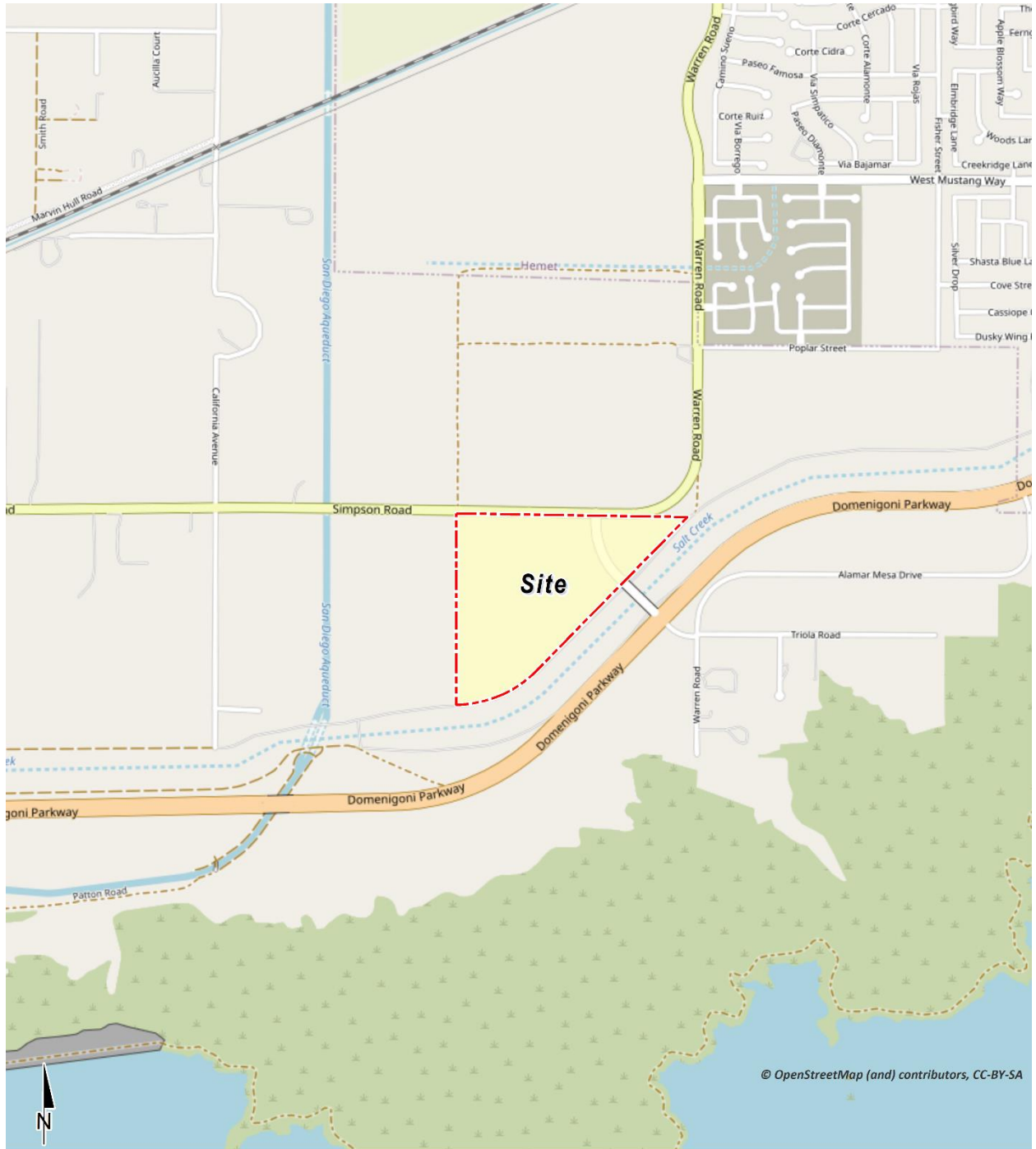
EXHIBIT 1-A: LOCATION MAP