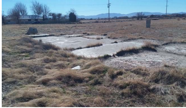
Figure 4 P-3, House Foundation, View to the Southwest