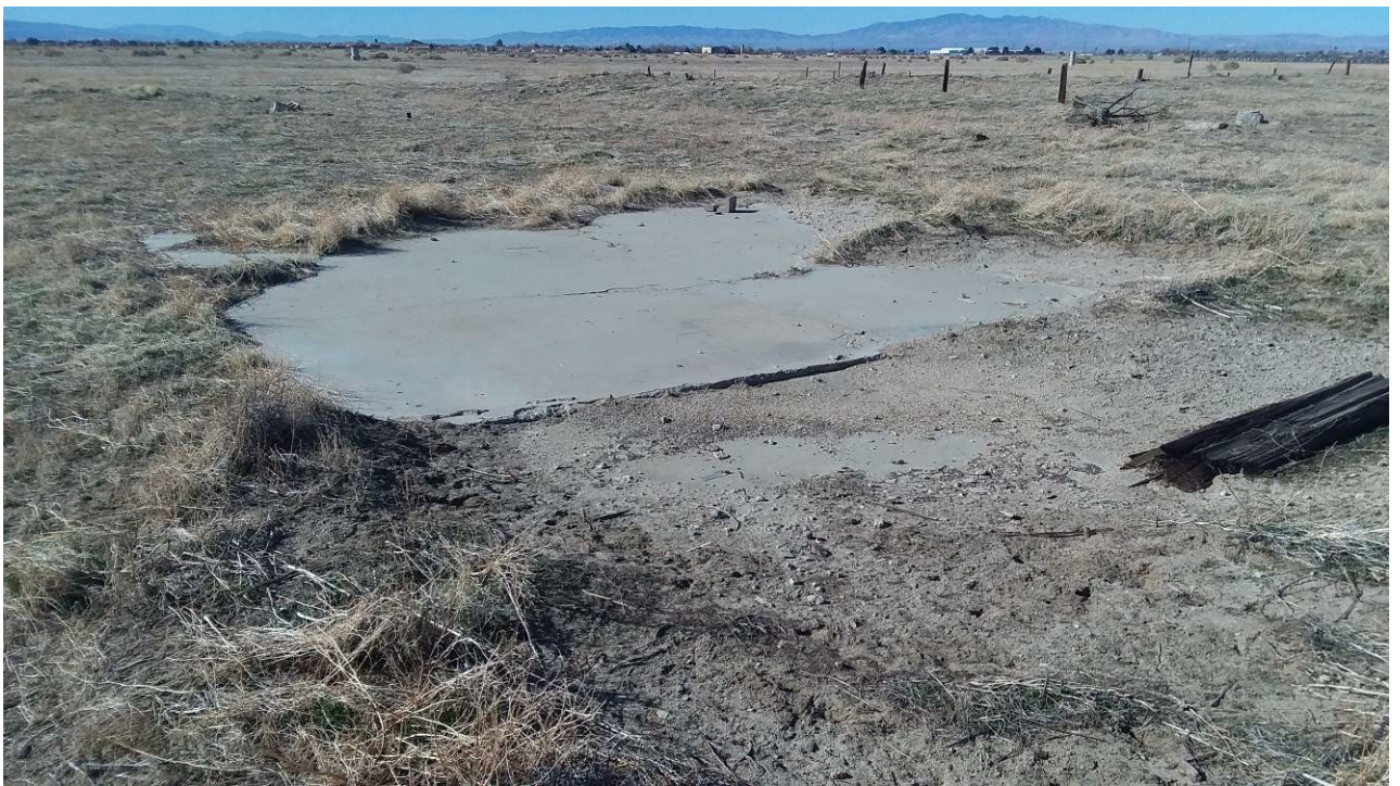
Figure 5 P-3, Outbuilding Foundation, View to the Northwest