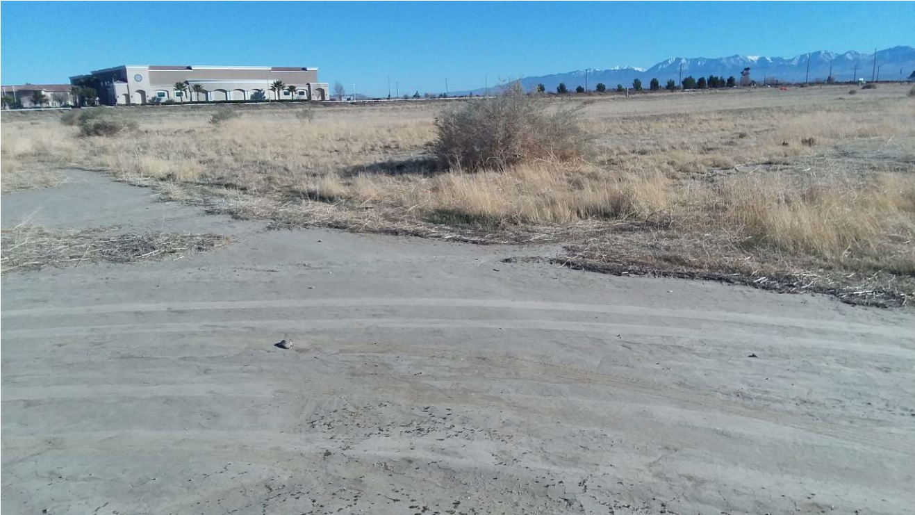
Figure 3 Project Area, View to the Southeast