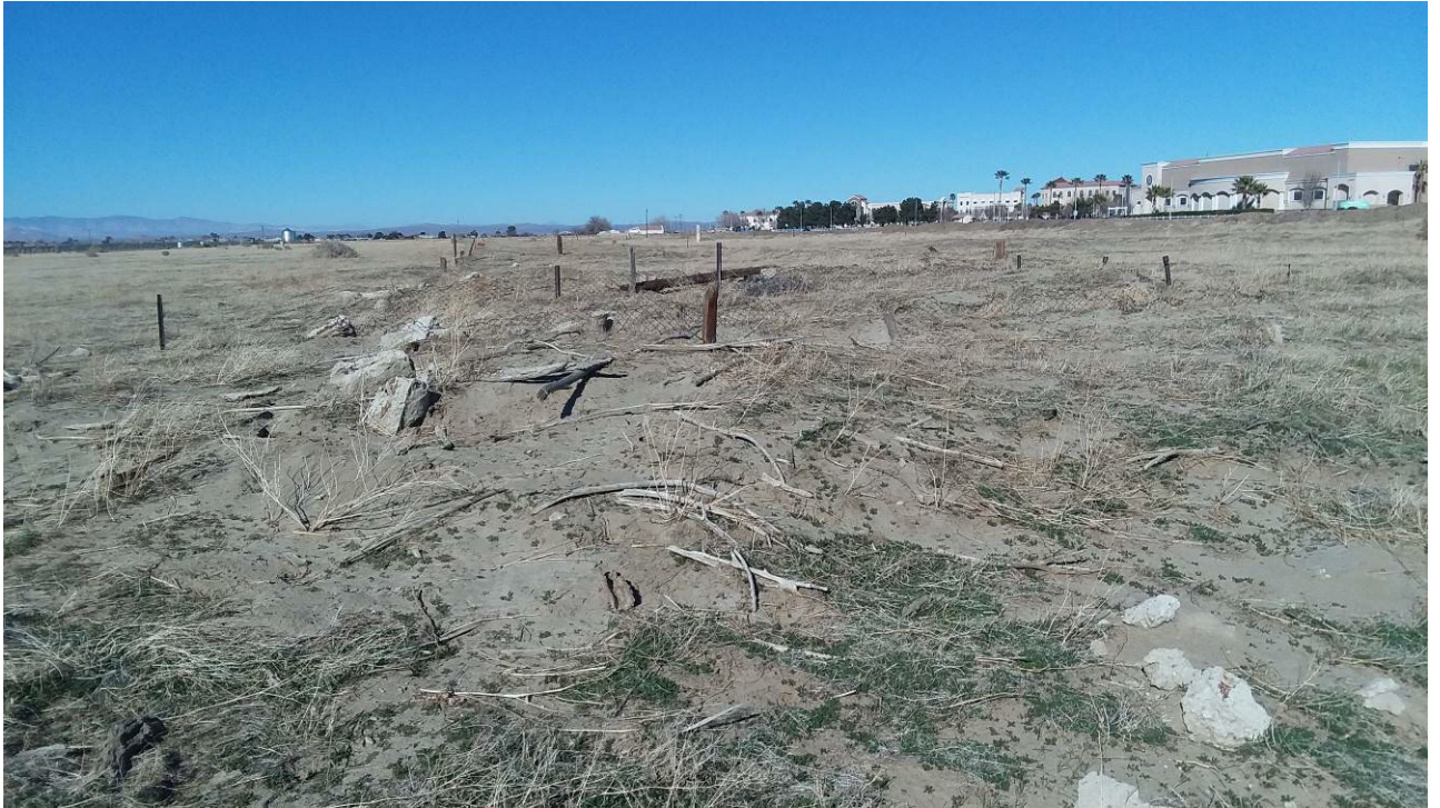
Figure 6 P-3, Cattle Pens, View to the North