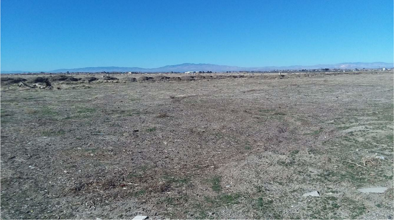
Figure 2 Project Area, View to the Northwest