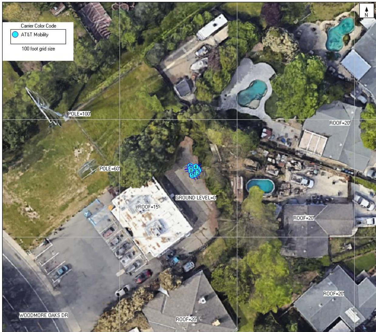
Figure 1: Antenna Locations

The antennas will be mounted on a 60-foot Monopine with centerlines 50, 48.12, & 51.71 feet above ground level. Proposed antenna operating parameters are listed in Appendix A. Other appurtenances such as GPS antennas, RRUs and hybrid cable below the antennas are not sources of RF emissions. No other antennas are known to be operating in the vicinity of this site.