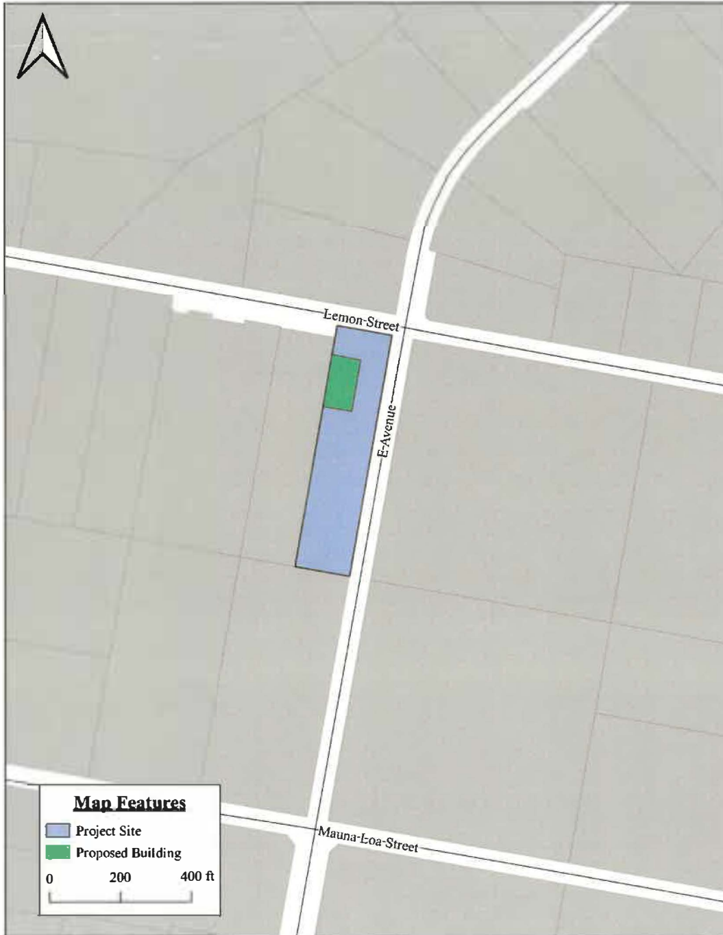
FIGURE 2. VICINITY MAP