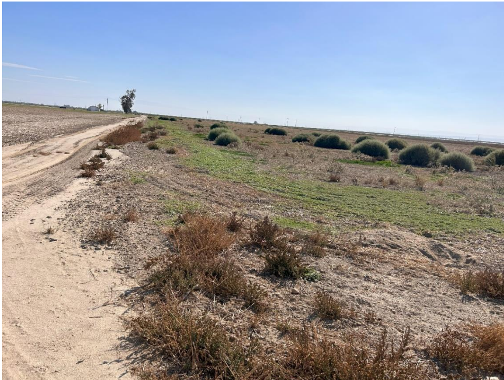
Photo 4. Looking south from Greely Road toward the proposed groundwater recharge ponds.