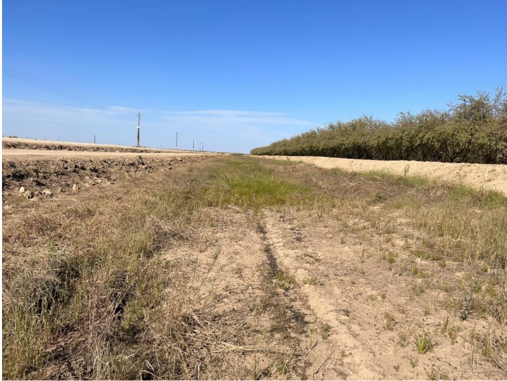
Photo 1. Looking north within the R-3 Canal toward the proposed groundwater recharge ponds.