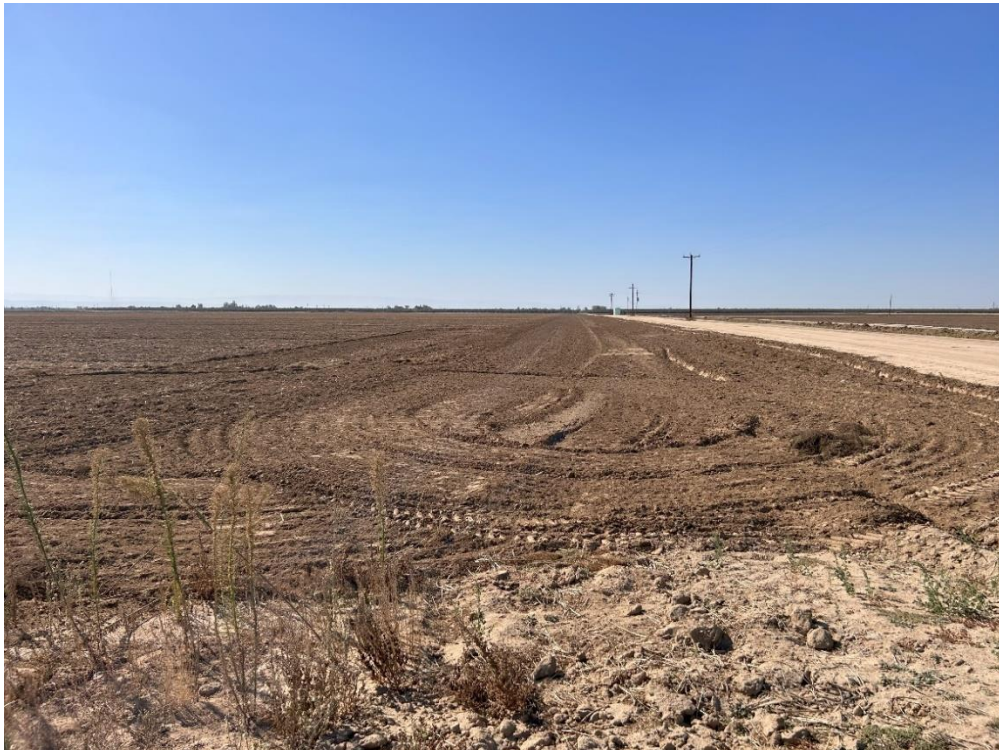
Photo 2. Looking south from Snow Road toward the proposed groundwater recharge ponds.