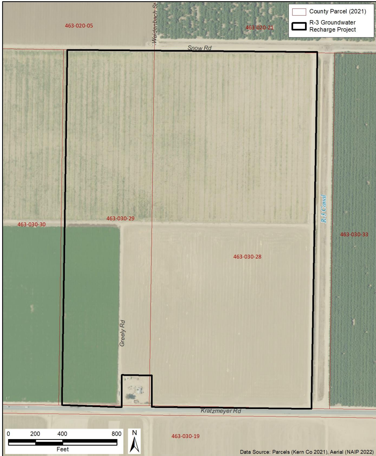
Figure 2-2. Project Area

Data Source: Parcels (Kern Co 2021), Aerial (NAIP 2022) Z:\Projects\2305132_NKWSR_RRID\2305132_G002_ProjectArea.mxd 18Dec2023 SI