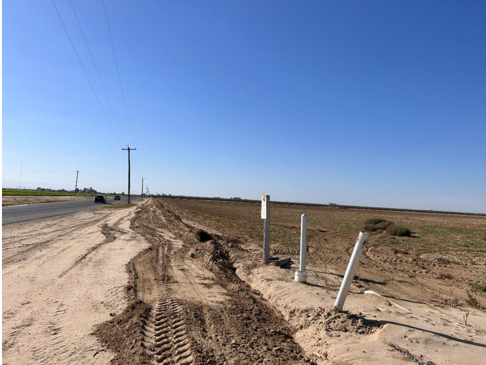
Photo 3. Looking west along Kratzmeyer Road toward the proposed groundwater recharge ponds.