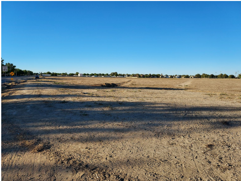
Figure 3 Project Area, View to the Northeast