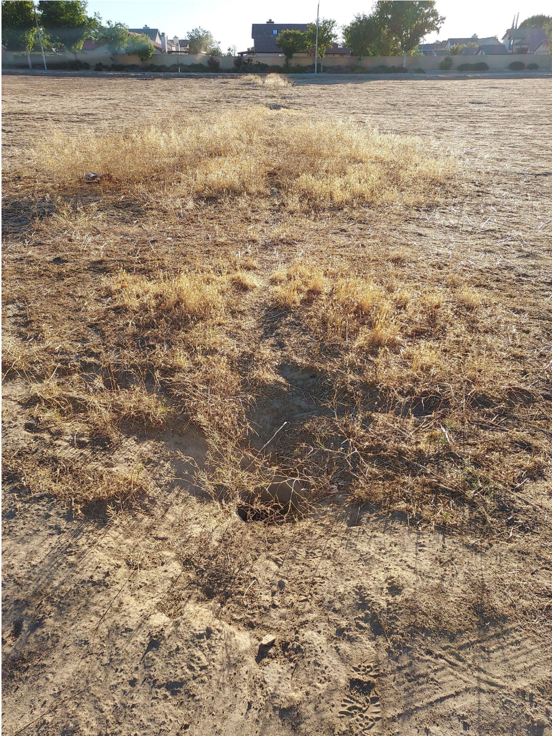
Figure 4 Project Area, Site R-5, View to the East