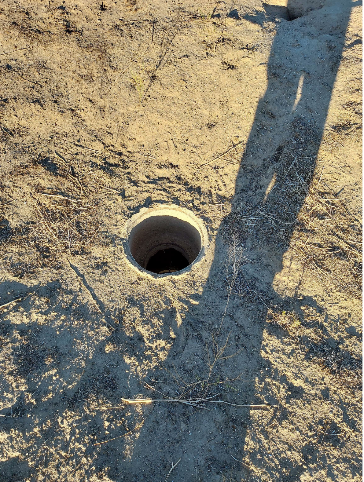
Figure 5 Project Area, Site R-5, Close-up on one opening in the Waterline