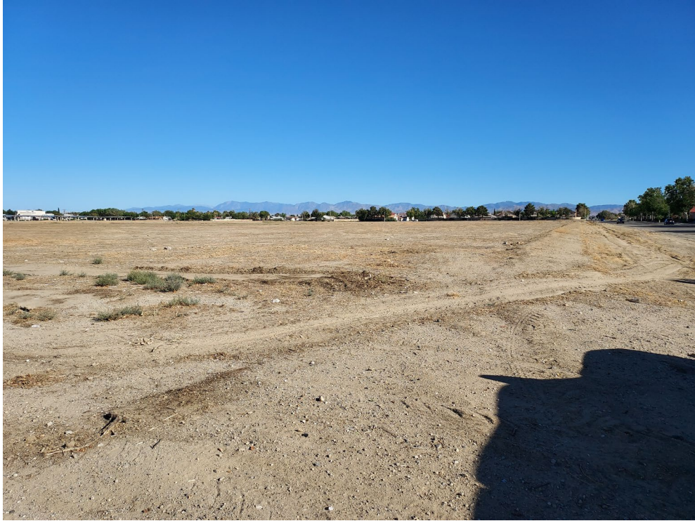
Figure 2 Project Area, View to the Southeast