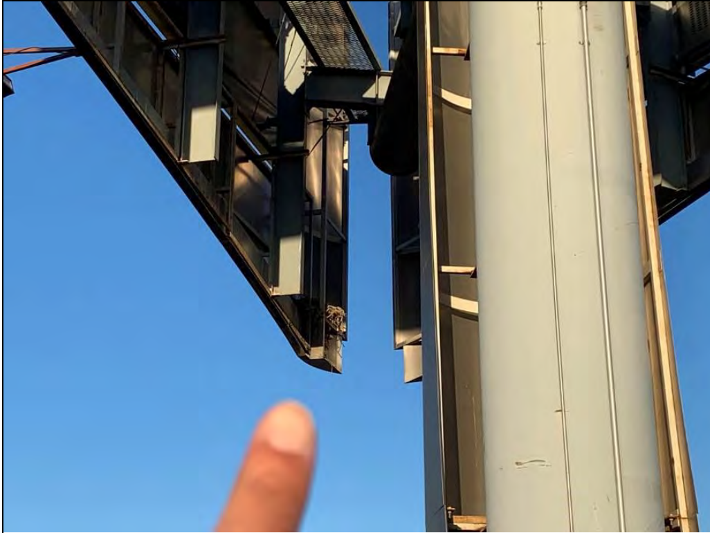
Photo 20. Old stick nest in billboard structure northwest of the Project Site, in the 500-foot buffer. Photo taken in 2023.