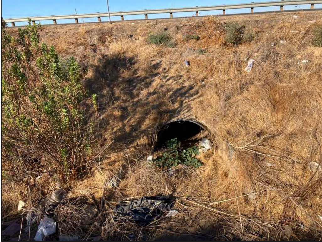
Photo 14. Culvert in survey buffer along eastern boundary under I-215 north onramp, facing west. Photo taken in 2021.