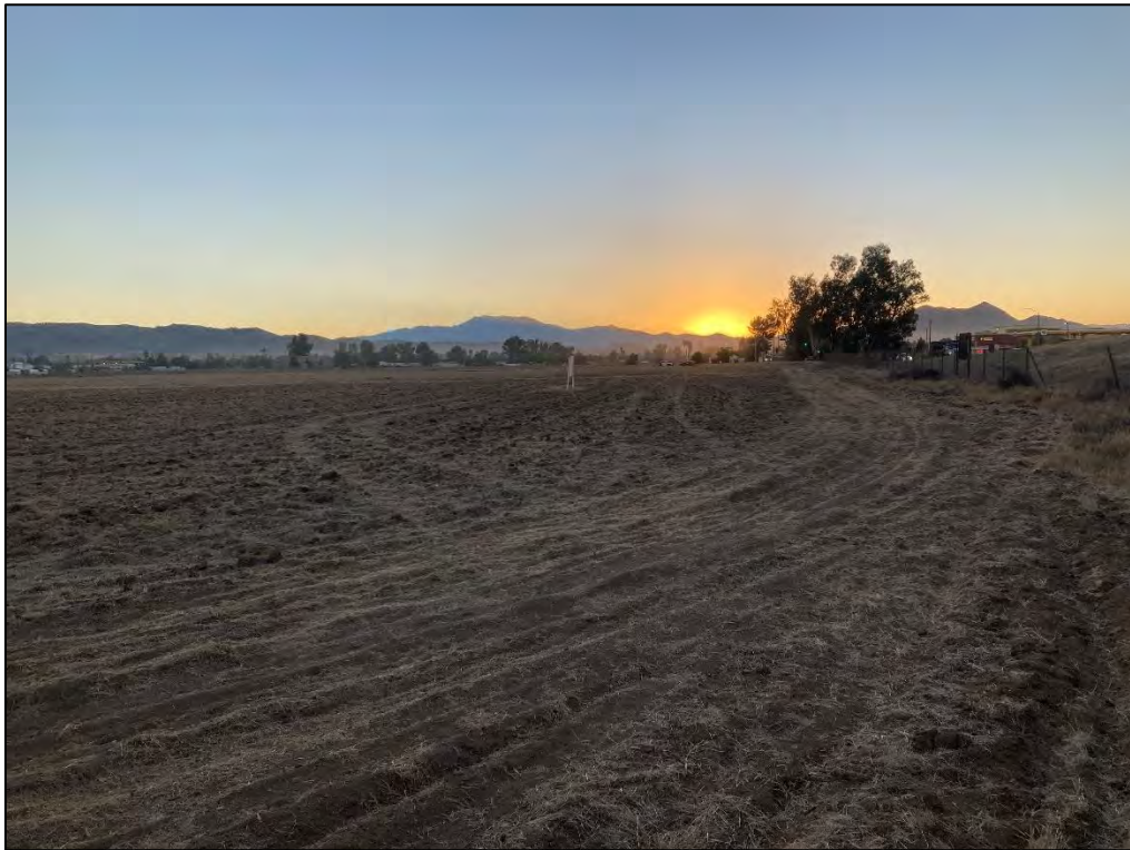
Photo 2. Representative photo of Project Site in 2021 from southwest corner, facing east.