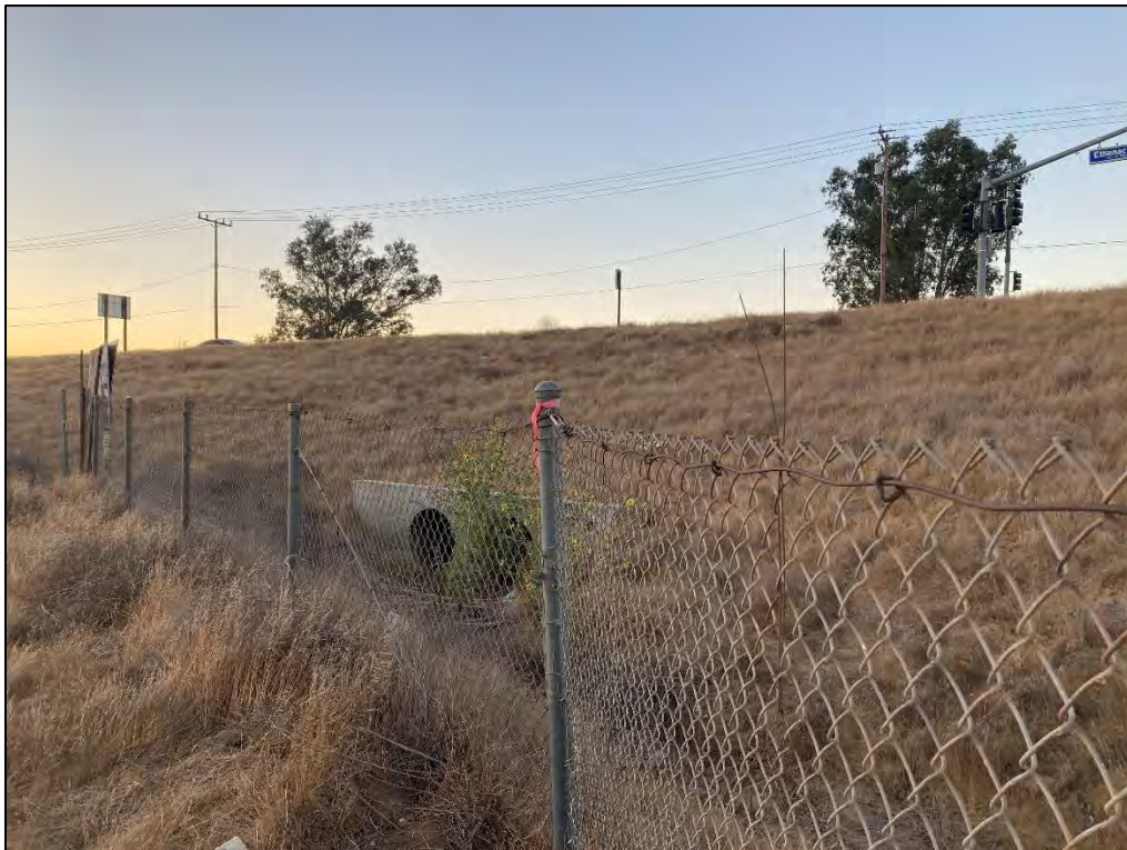
Photo 13. Two culverts in survey buffer outside of southwest corner of Project Site, facing south. Photo taken in 2021.