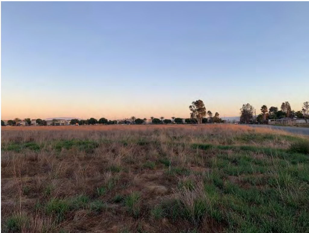
Photo 17. Project Site at northeast corner, facing north. Photo taken in 2023.