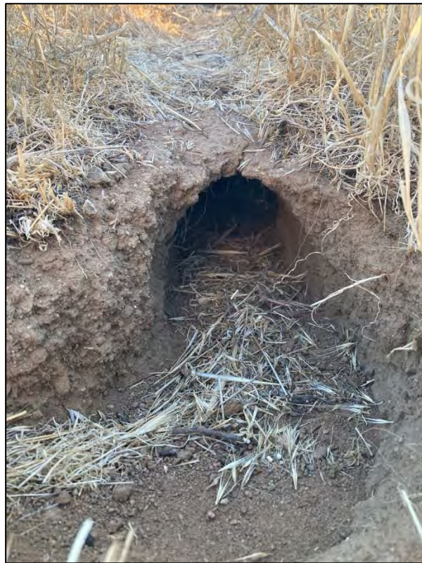
Photo 10. Potential burrowing owl burrow in the Project Site in 2021, no sign of burrowing owl use.