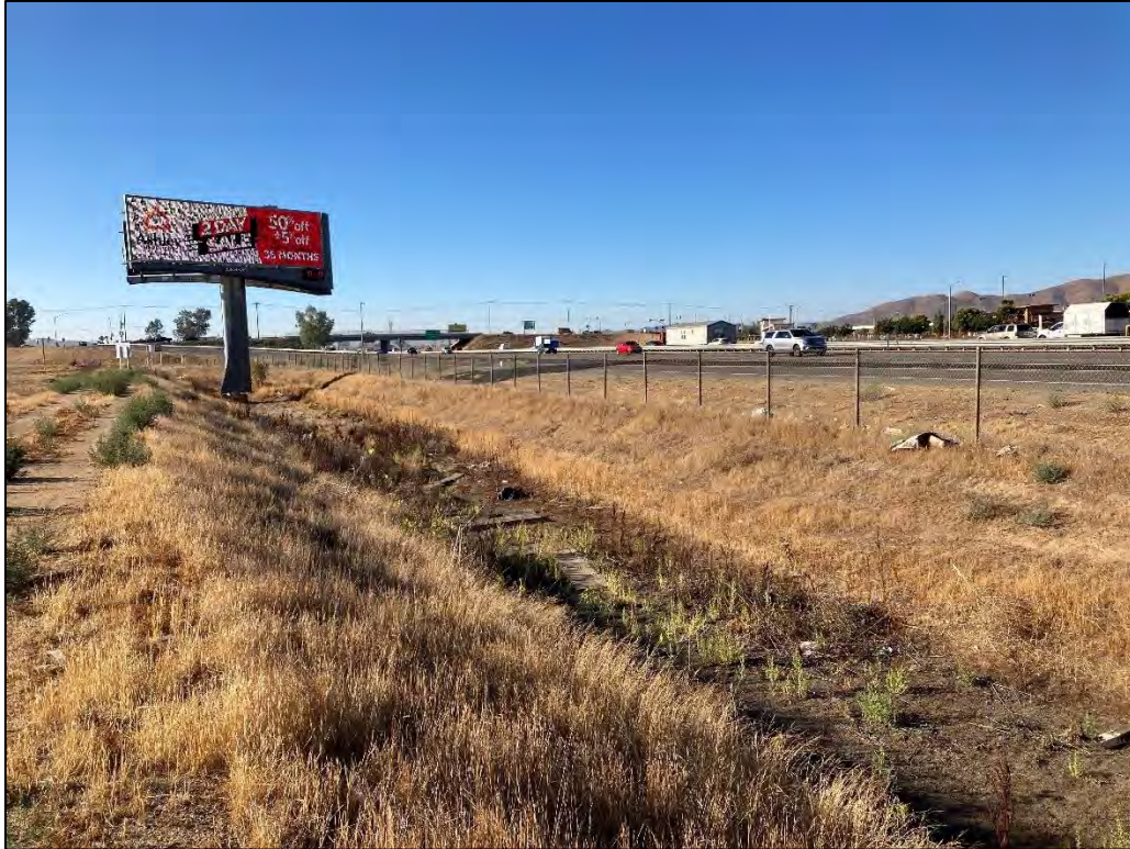
Photo 11. Roadside ditch located outside of the Project Site in the northwest portion of the survey buffer, looking south. Photo taken in 2021.