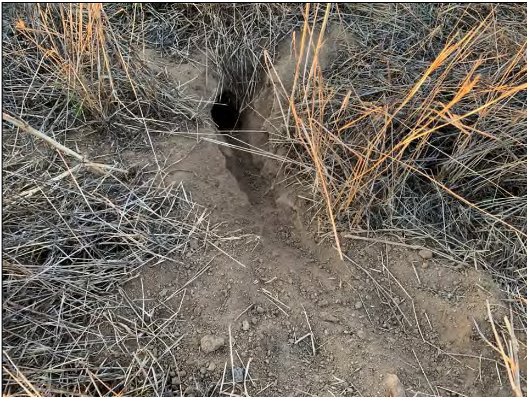
Photo 21. Representative photograph of a suitable potential burrowing owl burrow. Taken in 2023.