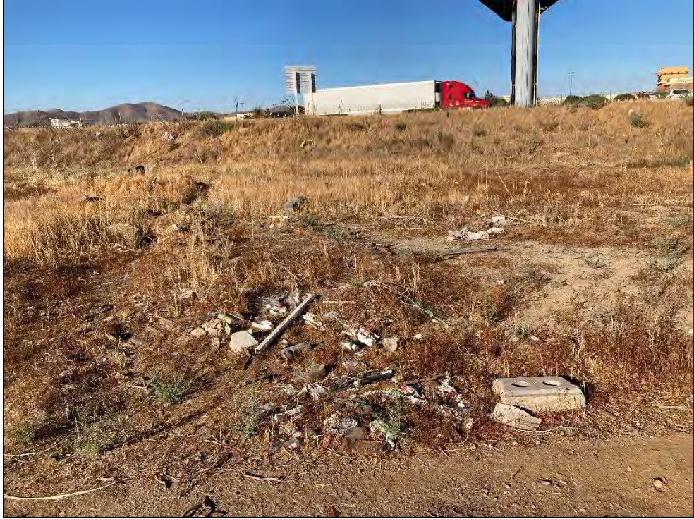
Photo 7. Trash observed in the Project Site in 2021 within the north-western buffer, facing west.