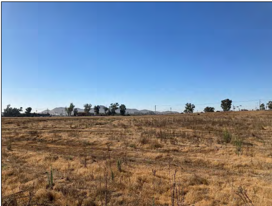
Photo 4. Representative photo of Project Site in 2021, facing south.