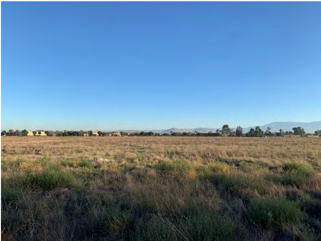
Photo 15. Project Site along the southern border, facing north. Photo taken in 2023.