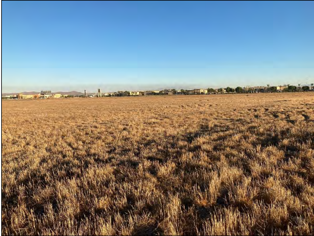
Photo 3. Representative photo of Project Site in 2021, facing northwest.