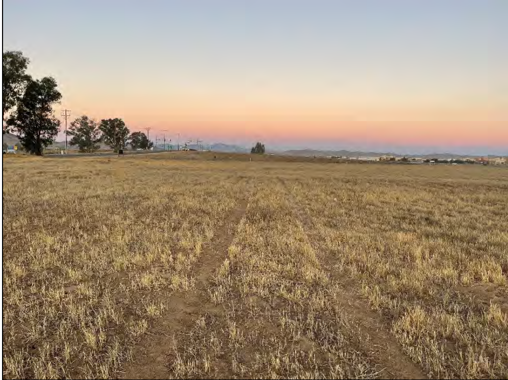
Photo 1. Disturbed nonnative grassland present on the Project Site in 2021, facing west.