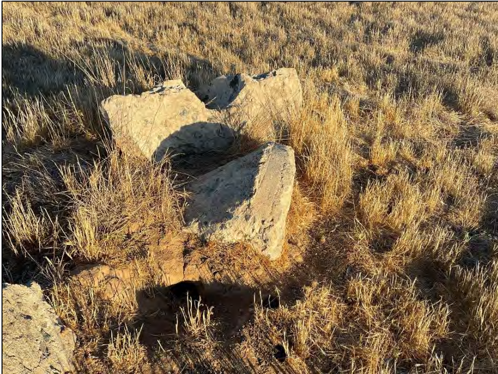
Photo 8. Aggregate pile with ground squirrel burrows observed in 2021.