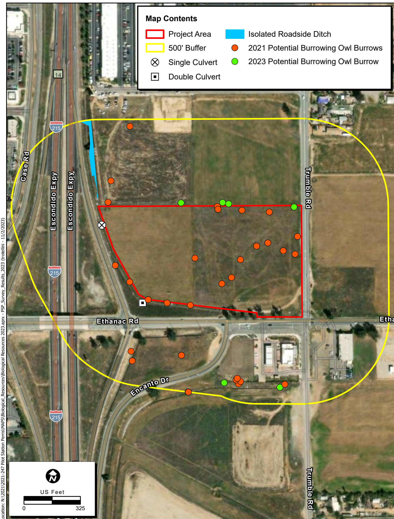
Figure 4. 2023 Biological Resources Survey Results