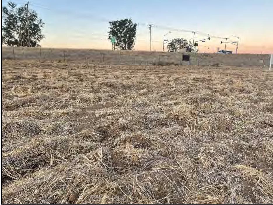
Photo 5. Land recently disced at the southeastern end of the Project Site in 2021, facing southwest.