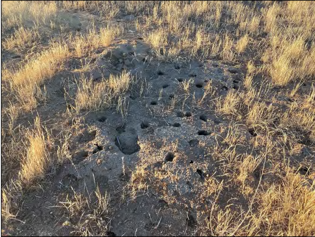
Photo 9. Representative photo of small mammal burrows present in the Project Site in 2021.