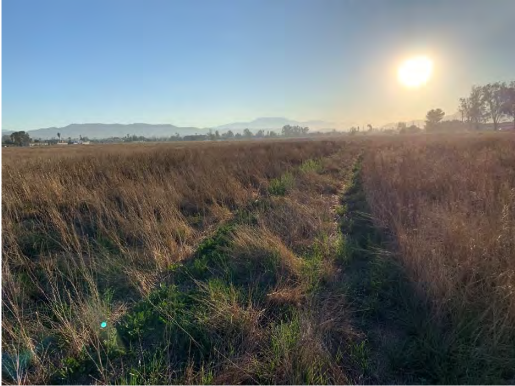
Photo 18. Old vehicle tracks within the southwest area of the Project Site. Facing east. Photo taken in 2023.