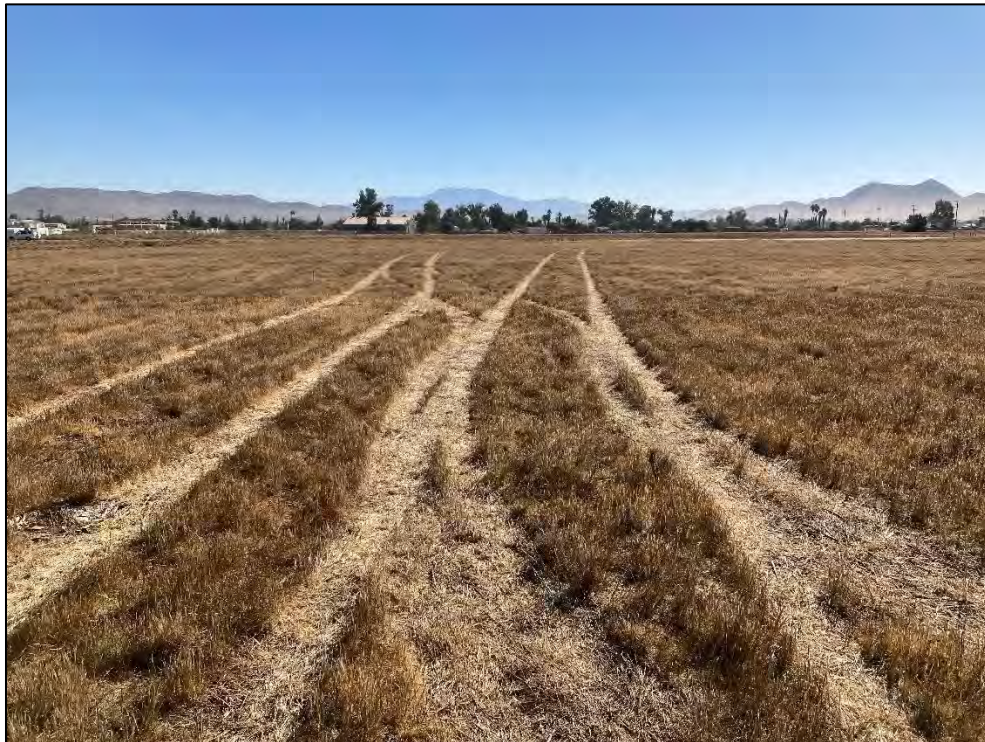
Photo 6. Representative photo of vehicle tracks in the Project Site in 2021, facing east.