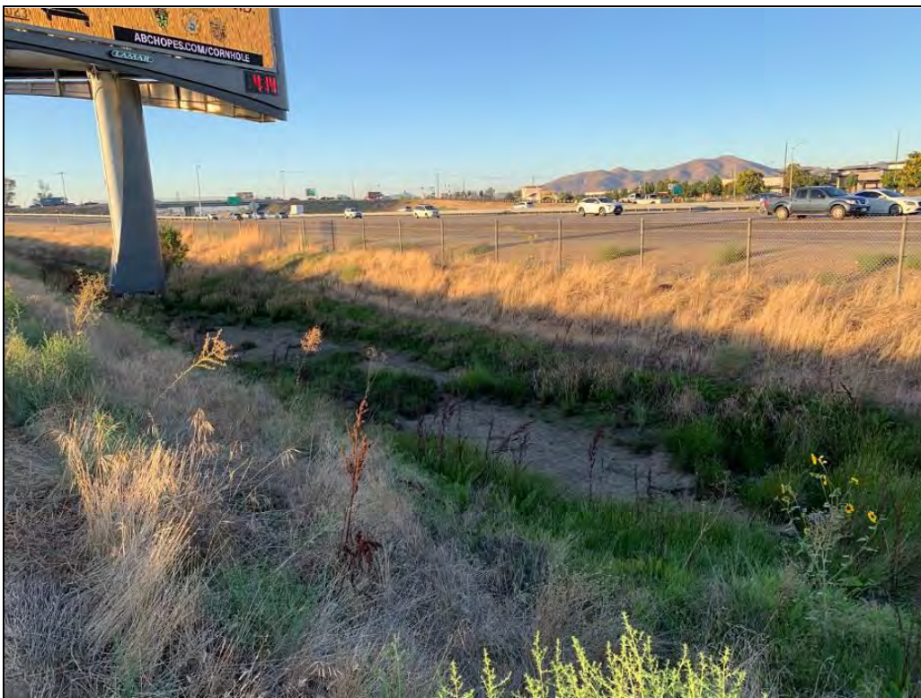
Photo 19. Isolated roadside ditch located northwest of the Project Site, in the 500-foot buffer, facing southwest. Photo taken in 2023.