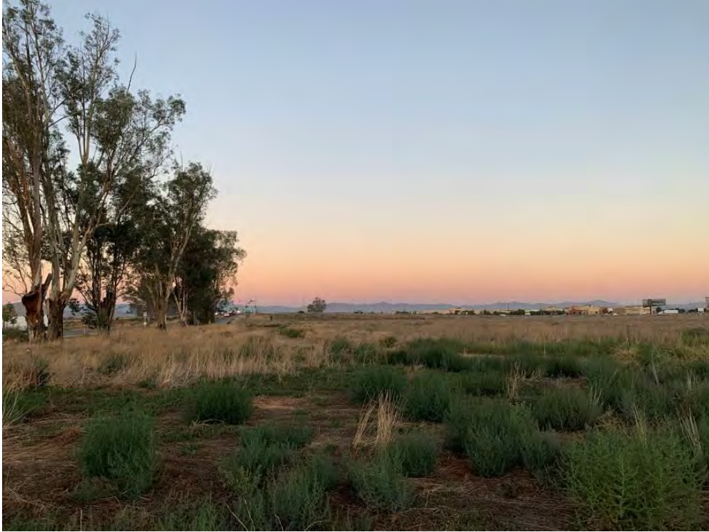
Photo 16. Project Site at southeast corner, facing west. Photo taken in 2023.