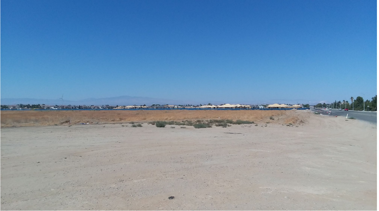
Figure 2 Project Area, View to the Northwest