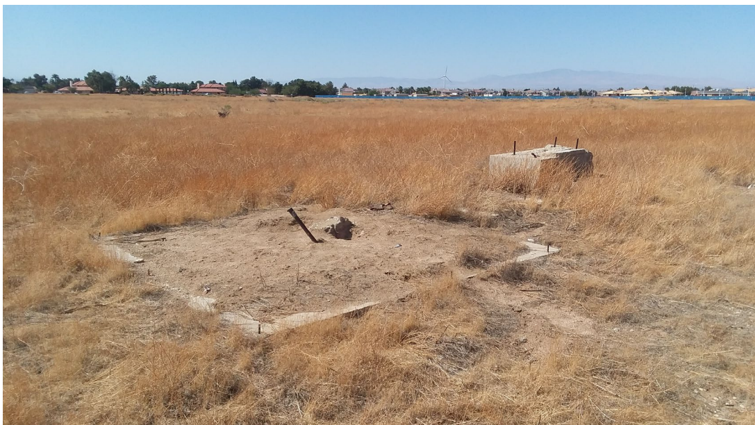
Figure 4 R-1, View to the West

One cultural resource was identified, R-1. R-1 is a small square, concrete foundation (Figures 4 and 5). A large architectural block of concrete is also present. The foundation is of indistinguishable age. Bolts attaching the building's foundation to the walls are still evident.