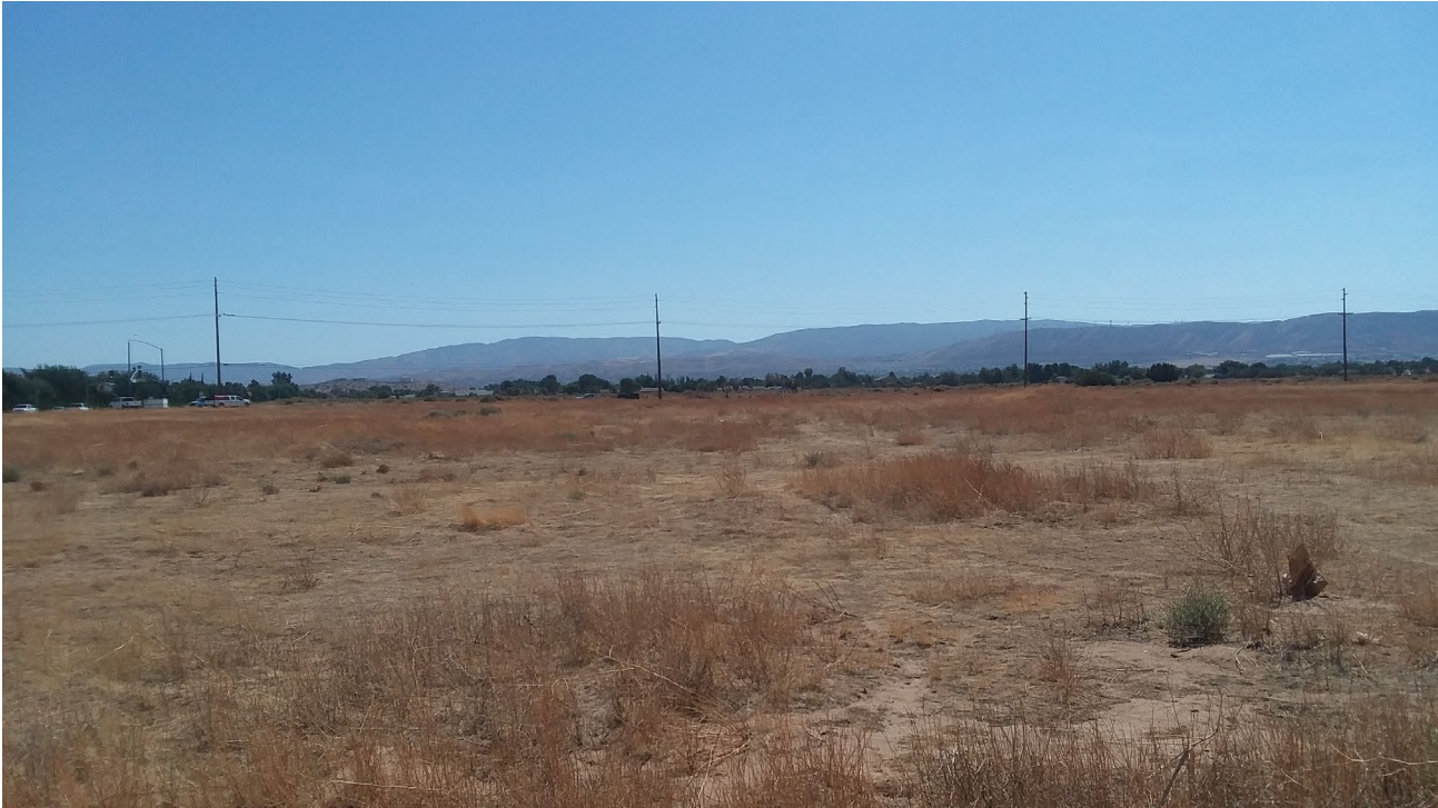
Figure 3 Project Area, View to the South