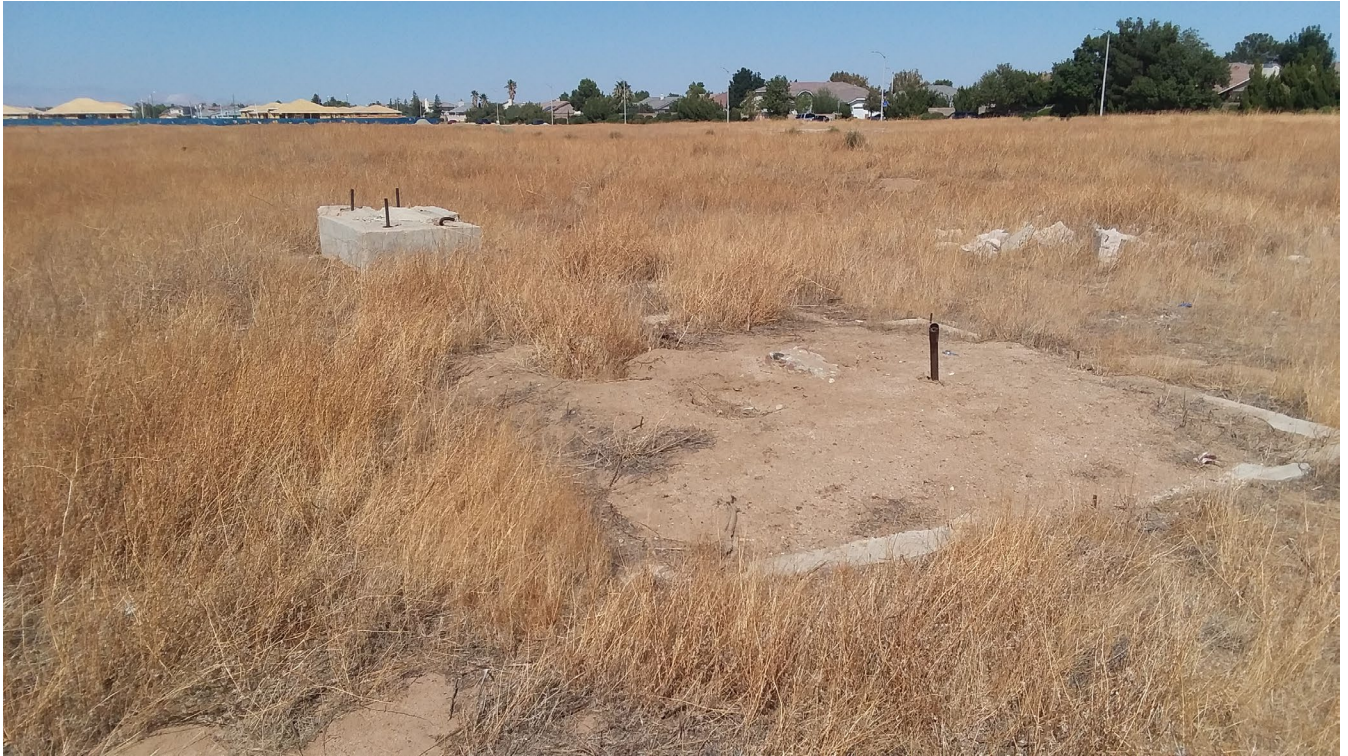
Figure 5 R-1, View to the North