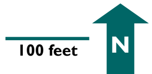
FIGURE I SITE LOCATION 225 N LAS POSAS RD. SAN MARCOS, CALIFORNIA