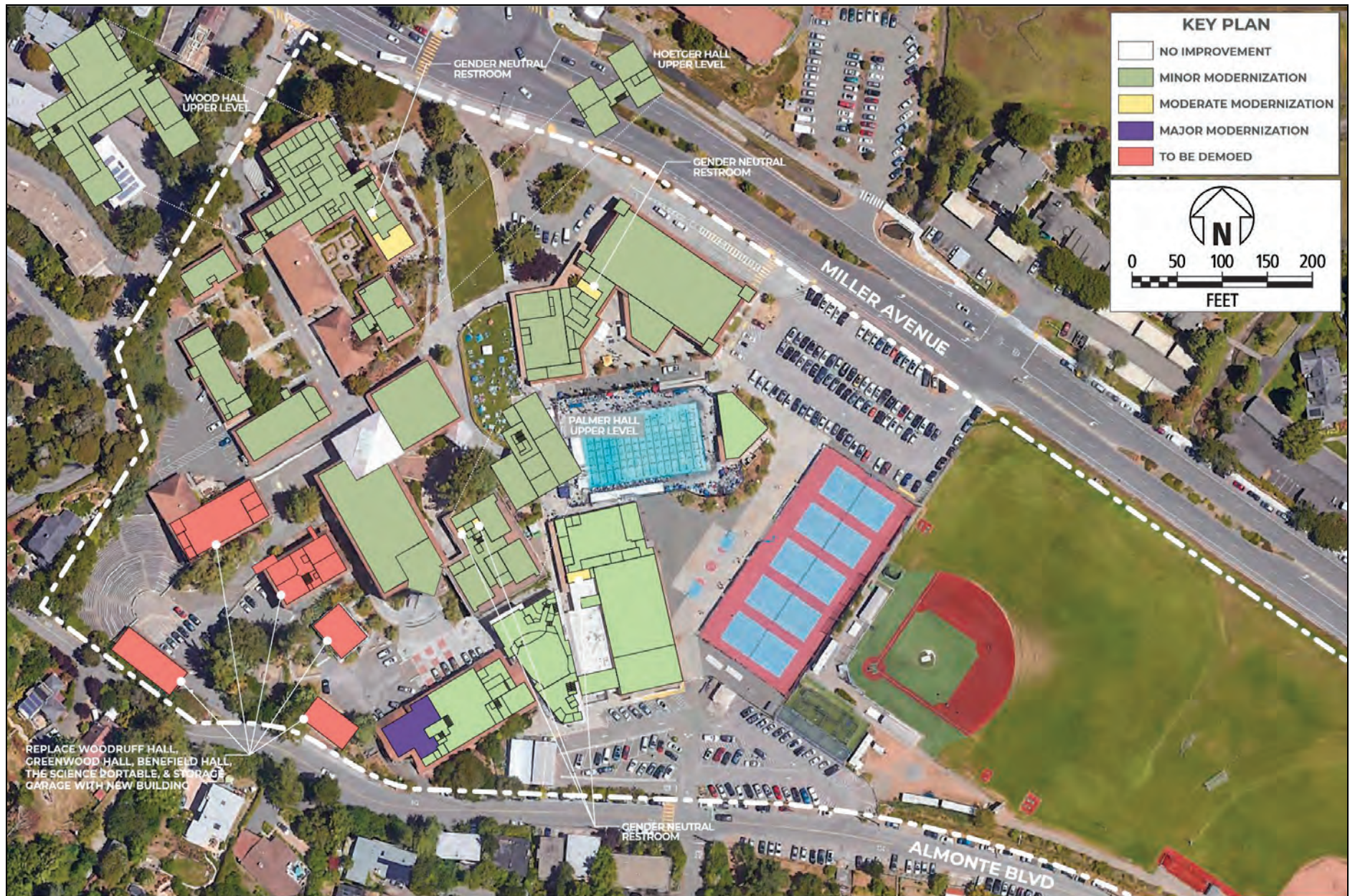
Figure 4 Proposed Building Demolition and Remodeling Locations