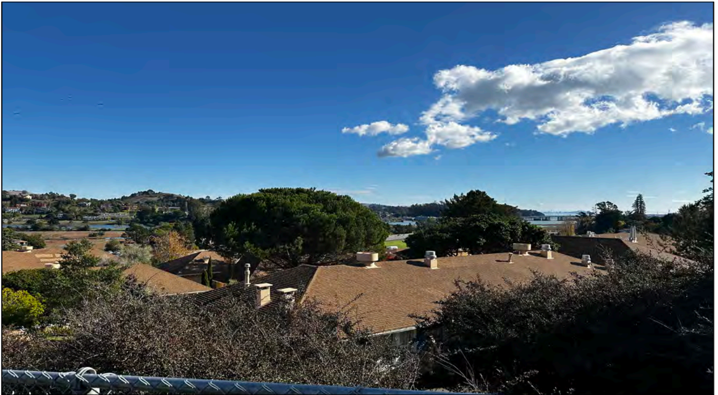
Intersection of Homestead Boulevard and Gomez Way Looking East