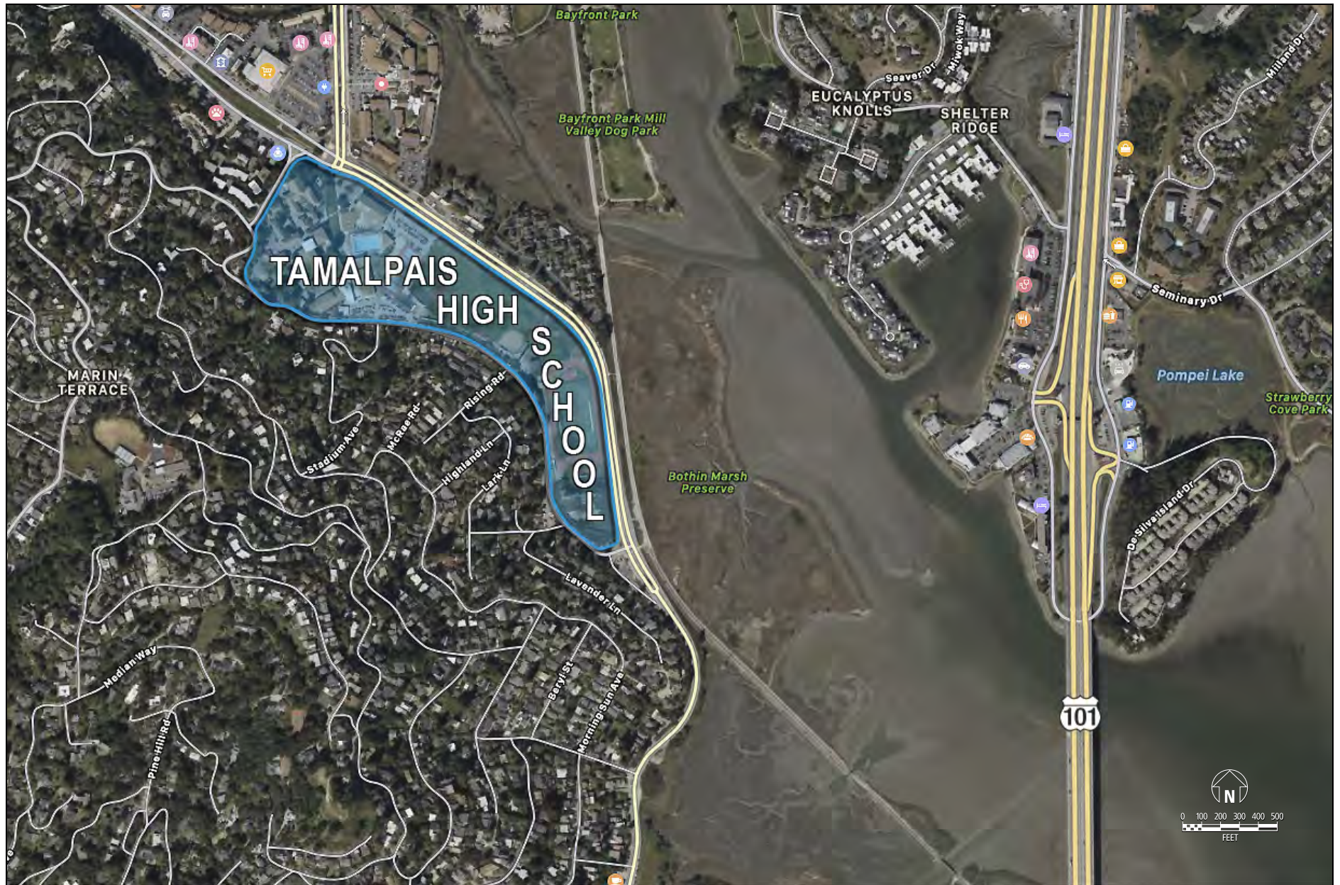
Figure 2 Project Vicinity