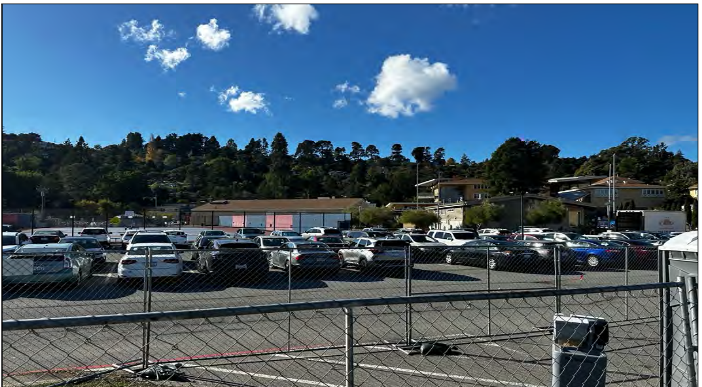
Miller Avenue Looking Southwest Towards Tennis Courts