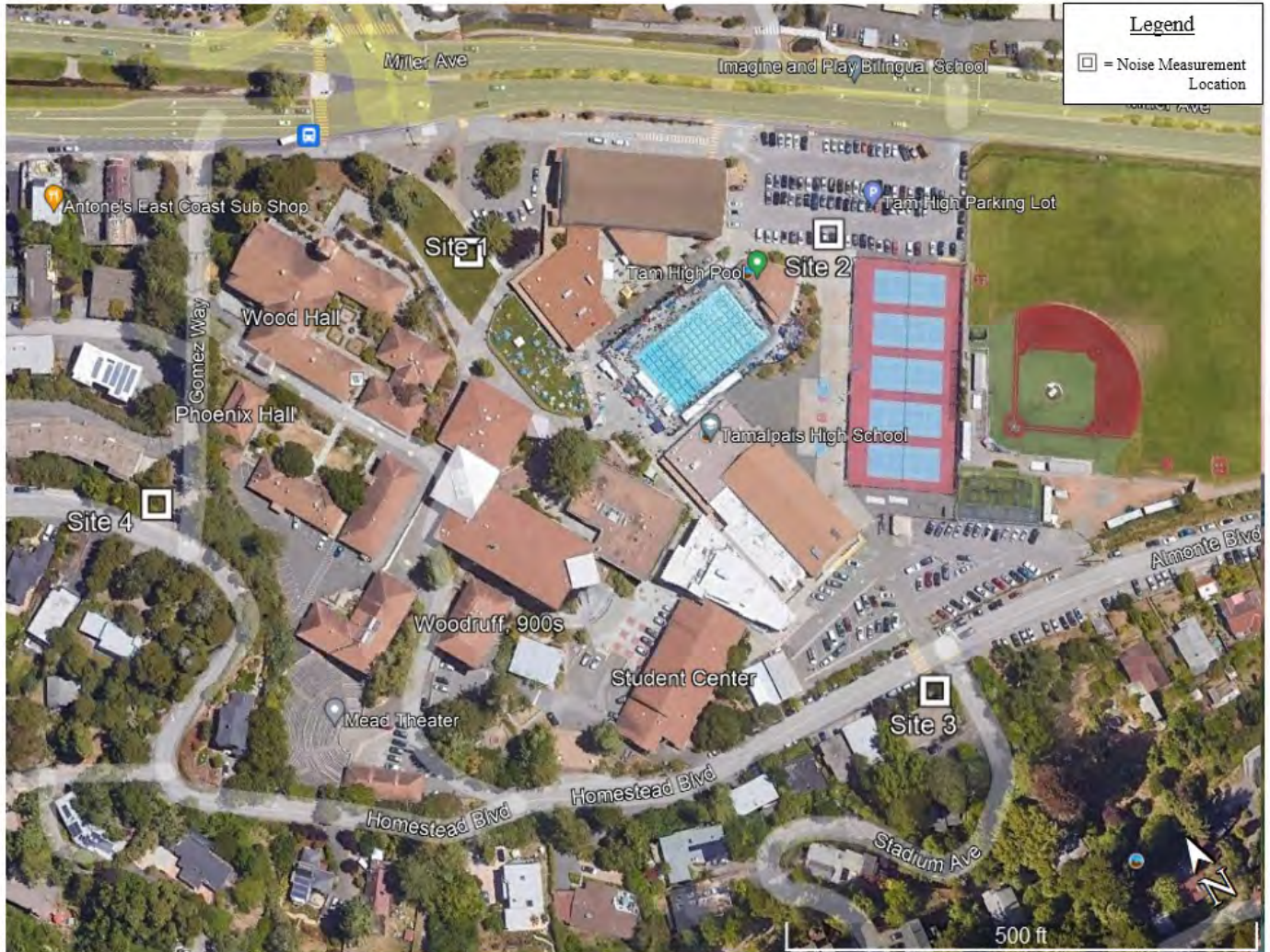
Figure 7 Noise Measurement Locations