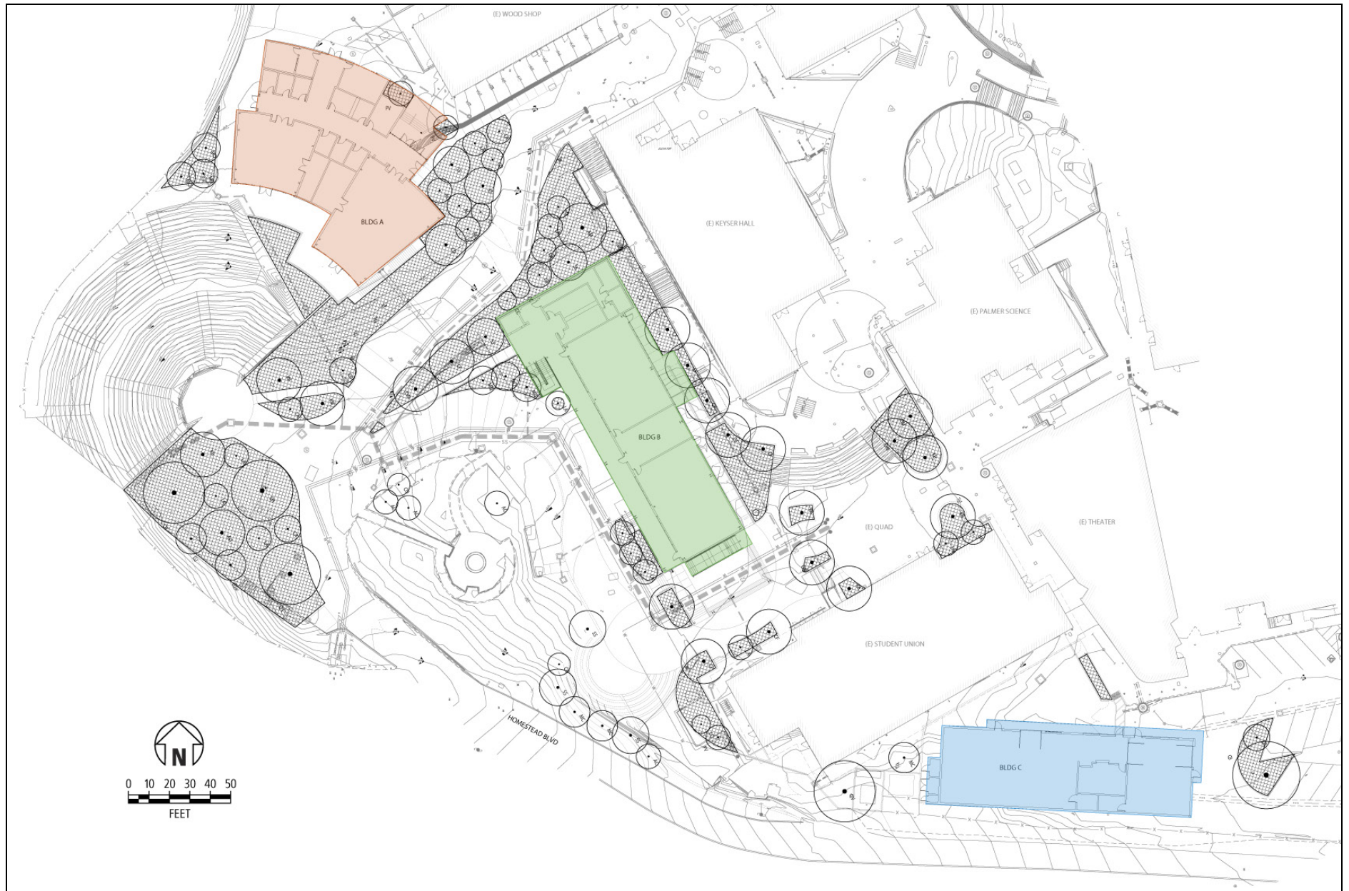
Figure 3 Project Development, Grading, and Landscape Plan