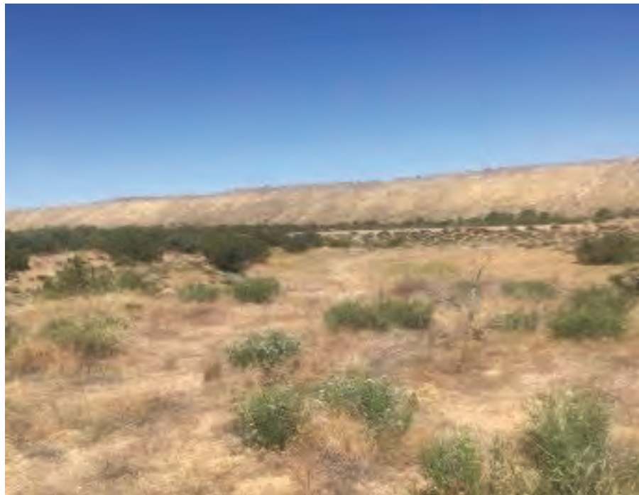
View from the Project site to the south towards Highway 173.