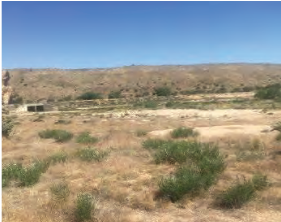
View from the Project site to the northwest. Mojave River Forks drainage in the upper portion of the photograph.