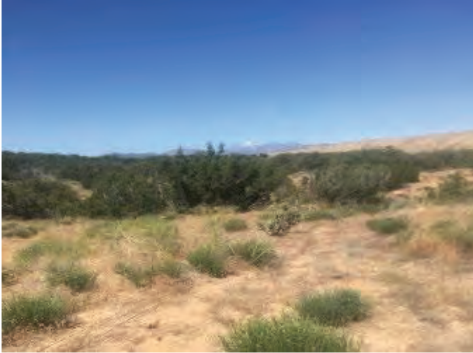
View from Project Site towards the southwest.