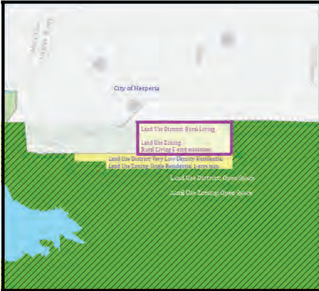
Figure 1 Land Use of the Property