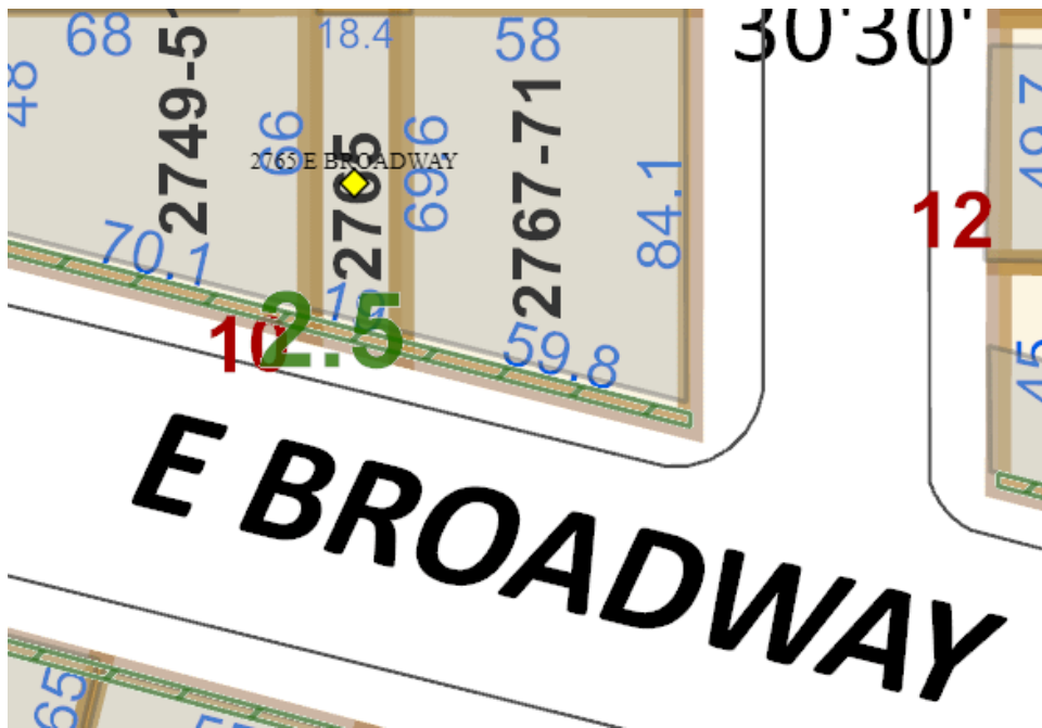
Figure 1 – Vicinity & Aerial Map