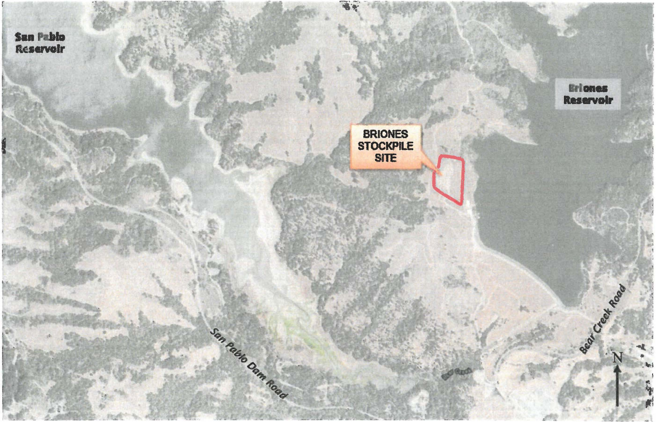
Figure 2 Briones Stockpile Site