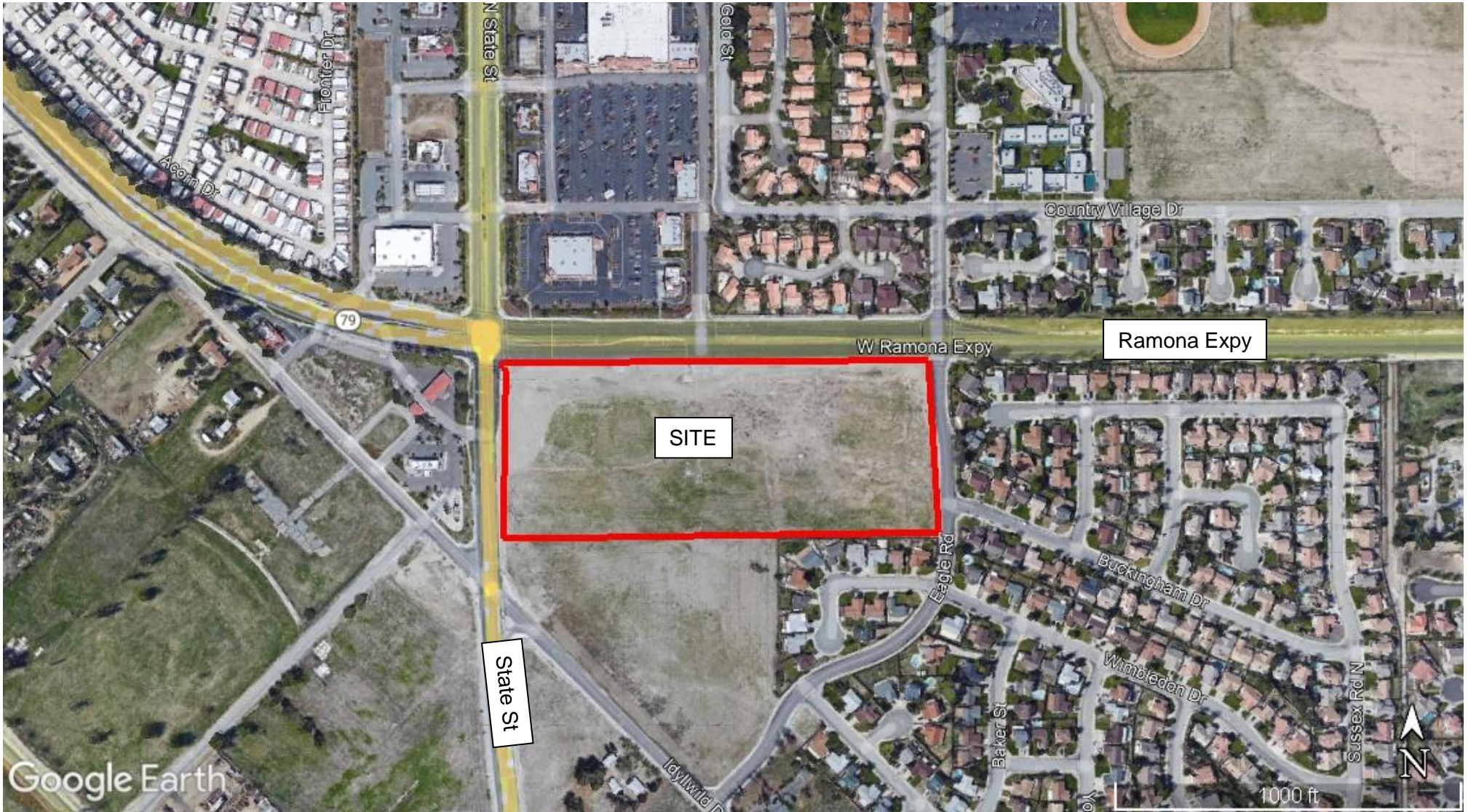
Exhibit A Location Map