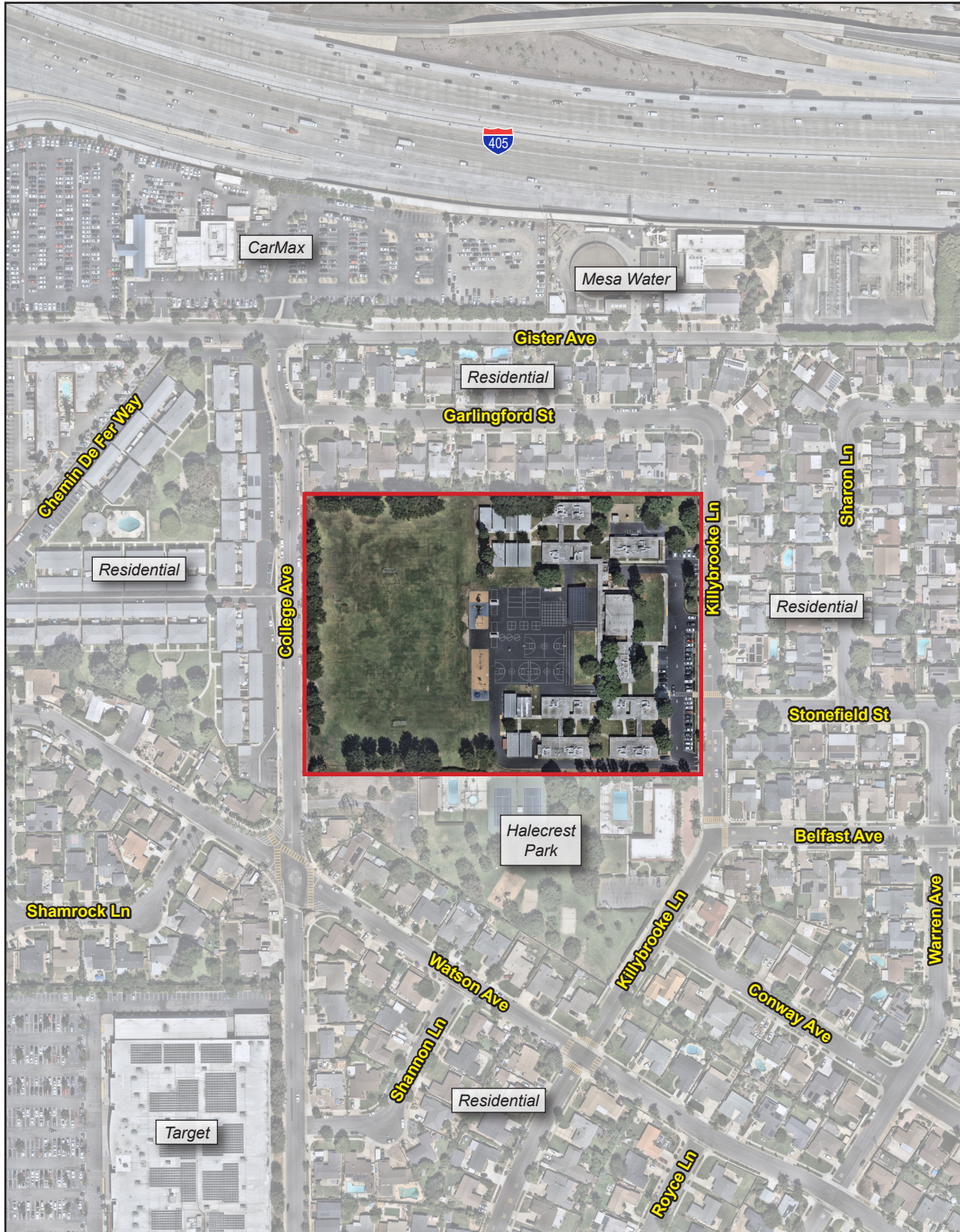
Figure 1 - Local Vicinity

— Killybrooke Elementary School Boundary