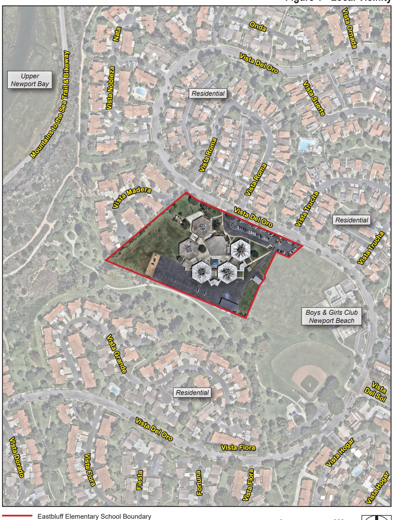
Figure 1 - Local Vicinity