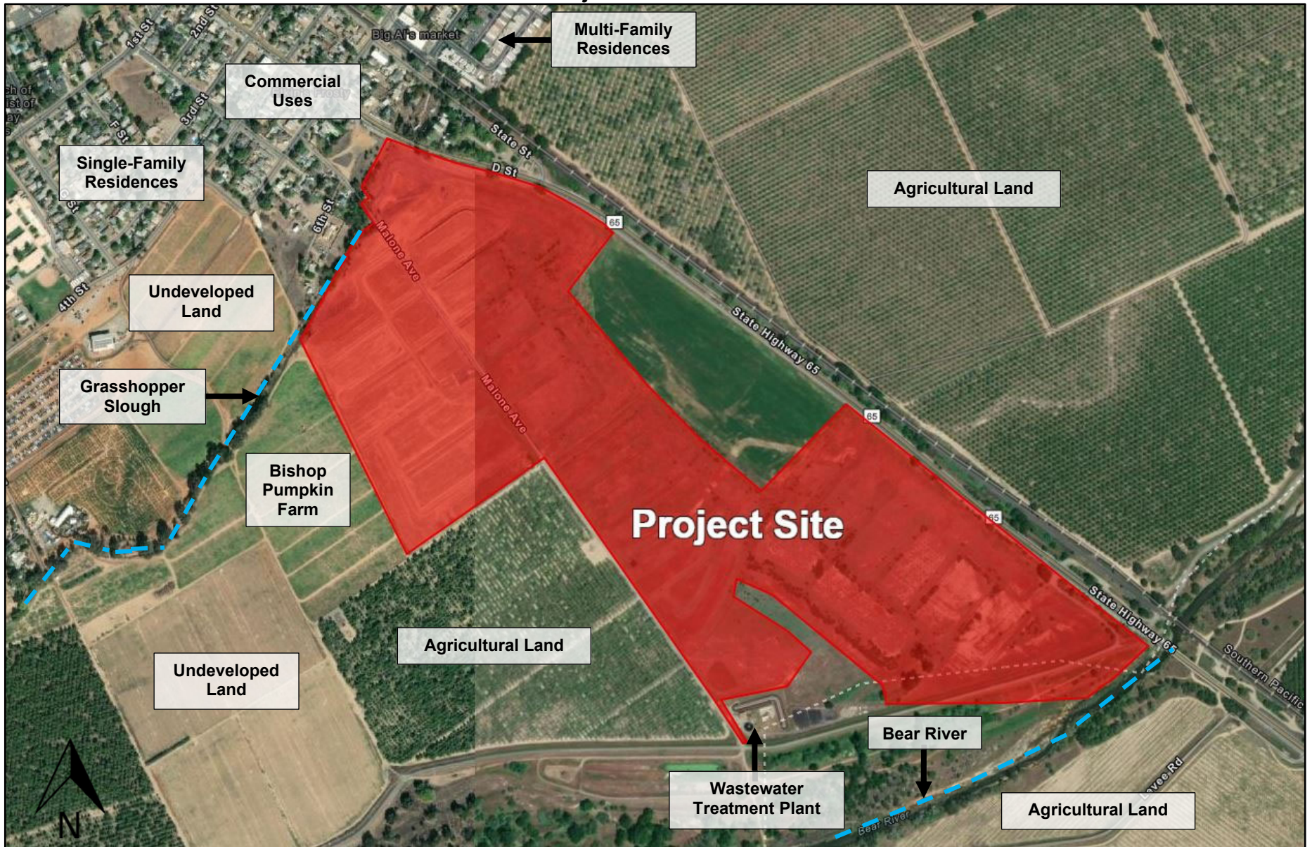
Figure 2 Project Location