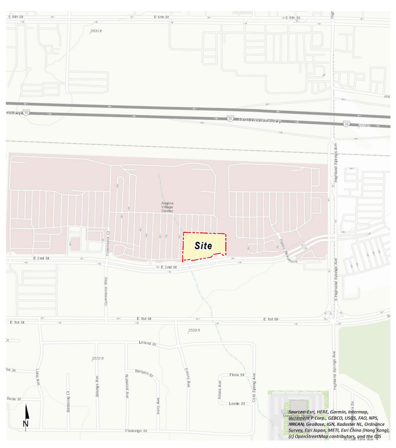
EXHIBIT 1-A: LOCATION MAP