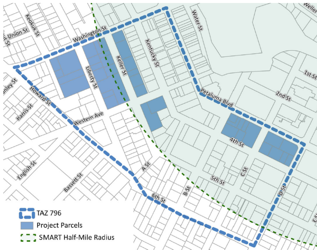
Plate 1 – Project Parcels and SMART Proximity

Unlike the zoning overlay component of the project, site-specific development details are known for the proposed Appellation Hotel project on the southwest corner of Petaluma Boulevard South/B Street. The hotel was found to qualify for major transit stop VMT screening in the Traffic Impact Study for the Petaluma Appellation Hotel Project , W-Trans, September 2023. That report provides further details, including a discussion of both the employee and visitor VMT characteristics of the hotel.