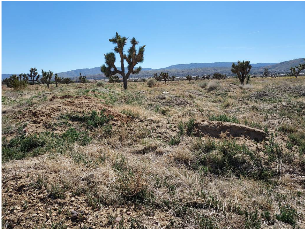
Figure 3 Project Area, Construction Mounds, View to the Southeast