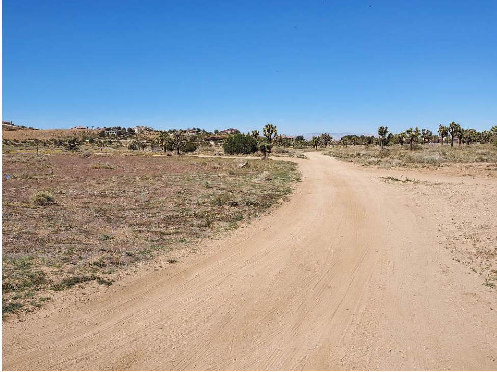
Figure 2 Project Area, View to the North