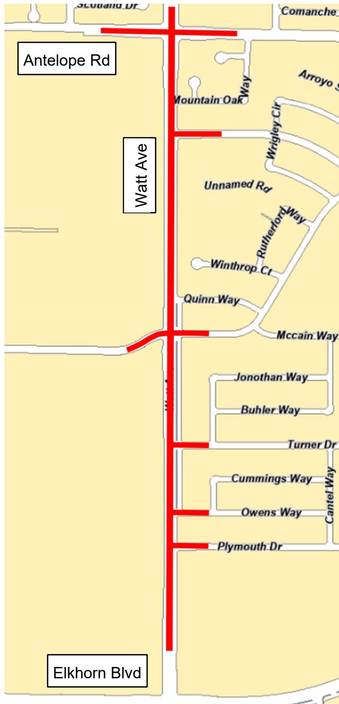
Watt Avenue (Elkhorn Boulevard – Antelope Road)