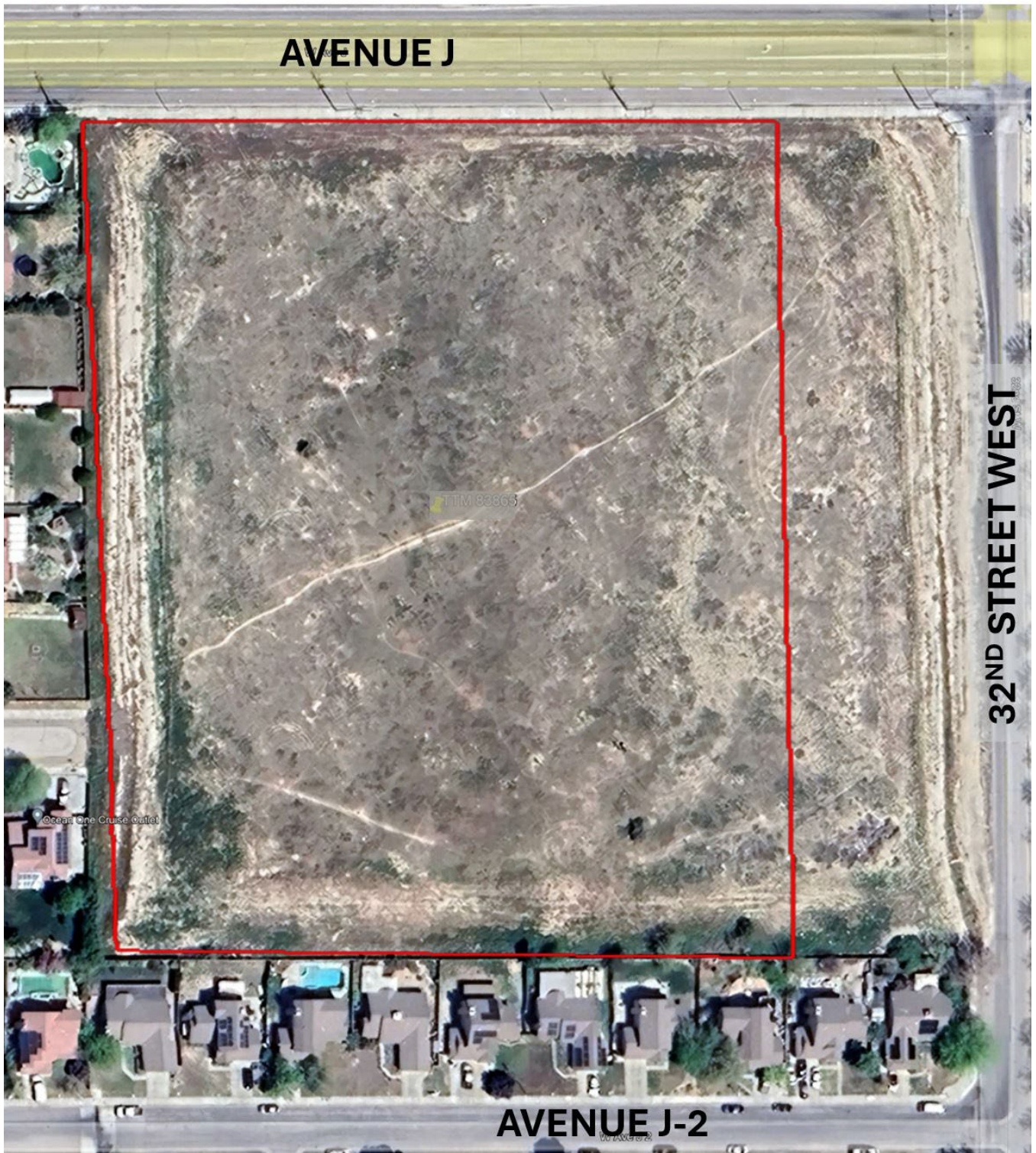
Figure 1, Project Location Map