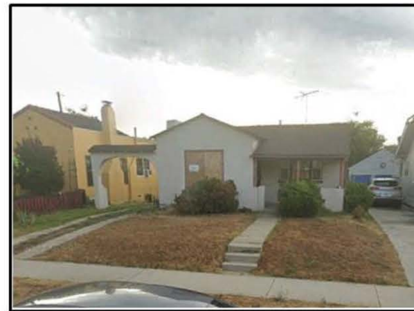
PHOTO 2: View of the western portion of the project site along Sheffield Avenue.