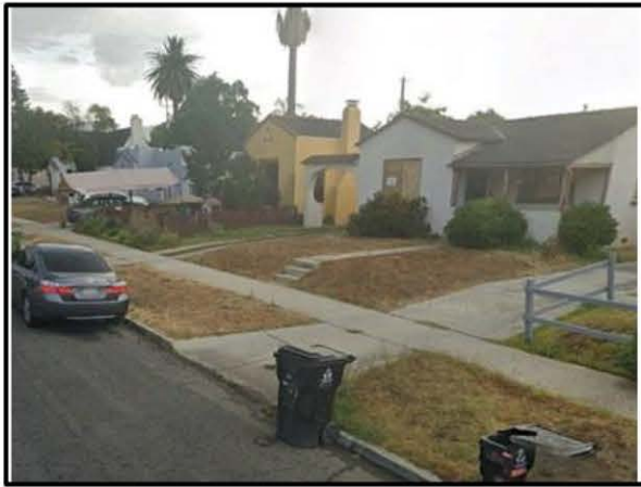
PHOTO 1: View of the northern portion of the project site along Sheffield Avenue.