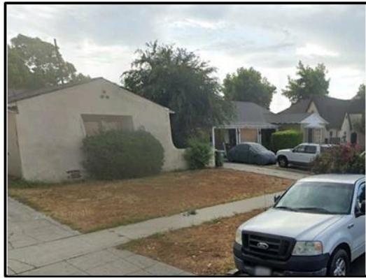
PHOTO 1: View of the southern portion of the project site along Sheffield Avenue.