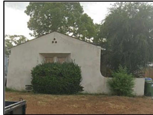
PHOTO 2: View of the western portion of the project site along Sheffield Avenue.