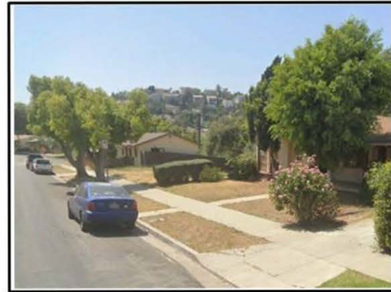
PHOTO 2: View of the western portion of the project site along Keats Street.