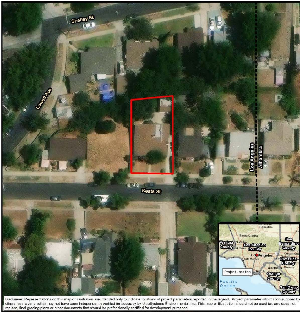
Figure 1 PROJECT LOCATION MAPS

Path: \\GIS\SVR\gis\Projects\7258_HACLA_1\project_sites_CE_NCE\MXD\7258_01_5477KeatsSt_5_0_Project_Location_2024_02_12.mxd Service Layer Credits: Sources: Esri, HERE, Garmin, USGS, Intermap, INCFMNT, P, NRCAn, Esri Japan, MFT, Esri China (Hong Kong), Esri Korea, Esri (Thailand), NGCC, (c) OpenStreetMap contributors, and the GIS User Community, Source: Esri, Maxar, Earthstar Geographics, and the GIS User Community; UltraSystems Environmental, Inc., 2024. February 12, 2024