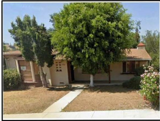
PHOTO 1: View of the southern portion of the project site along Keats Street.