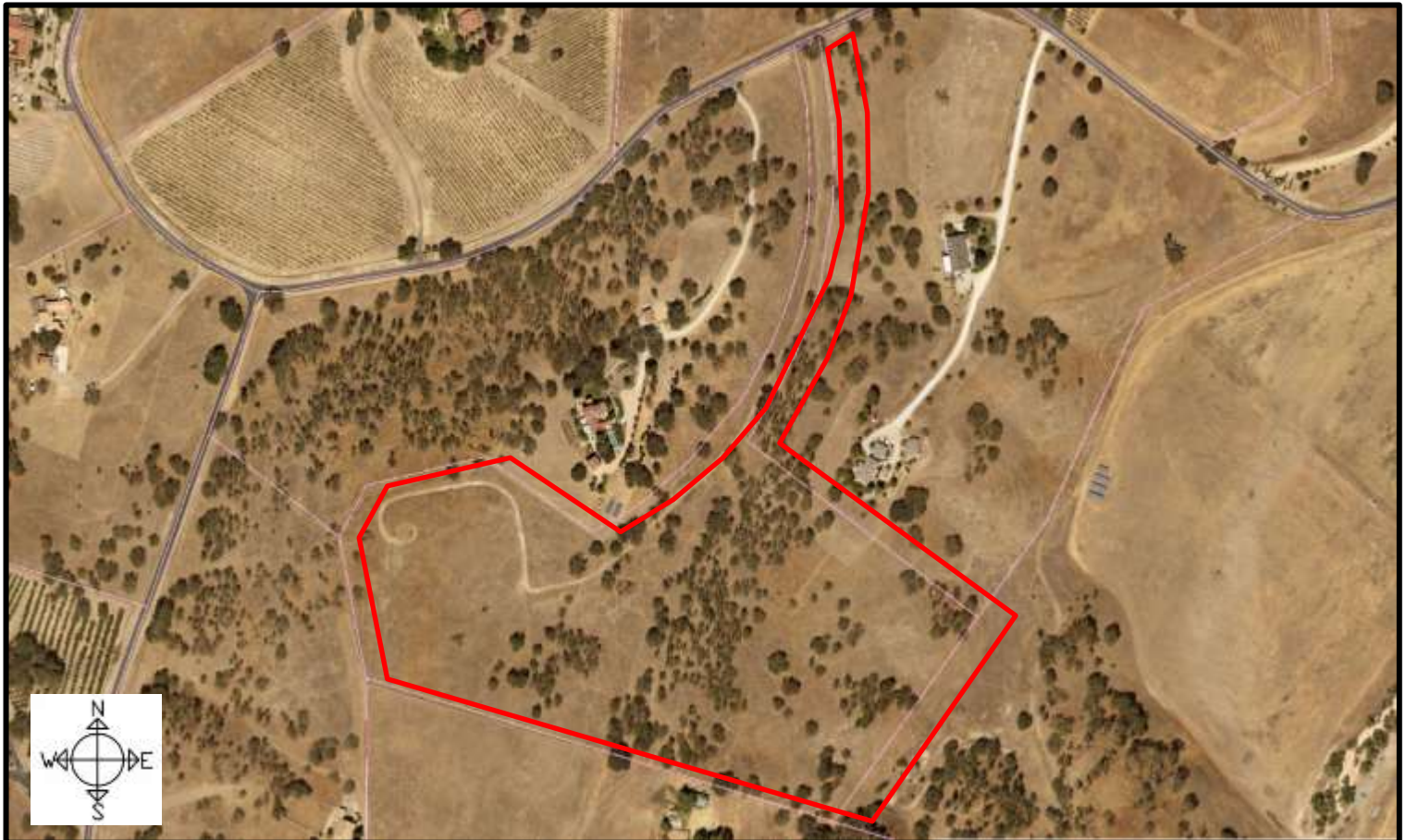
Figure 2. Project Boundary Aerial