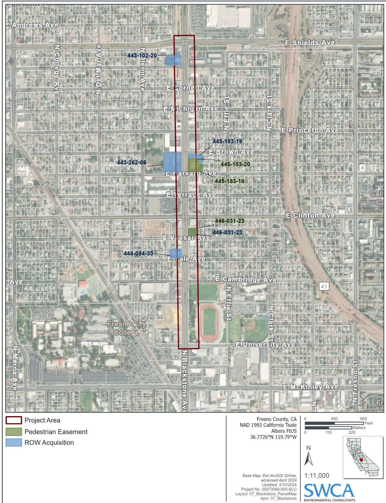
Figure 2. Proposed ROW Acquisition Map