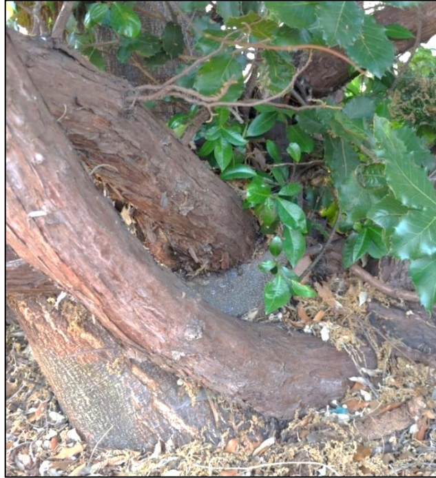
Photo 1. The bases of holly oak #315 and Chinese juniper #312 were so close that their trunks were embedded in one another.

Five blackwood acacias were in fair condition, with one (#351) in poor condition and #304 in good condition. Trunk diameters ranged from 4 to 30 inches, with an average of 15 inches. The roots of the three largest acacias (#301, 302, 364) were growing over nearby curbs. The trunks of acacias #334, 336, and 344 were obscured by shrubs.