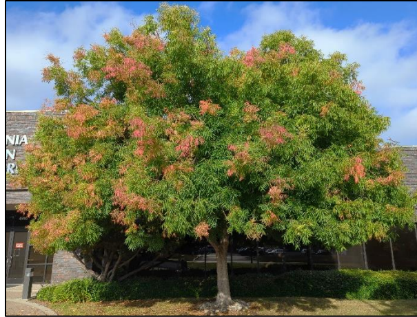
Photo 3. Chinese pistache #310 had an exceptionally wide, dense crown.