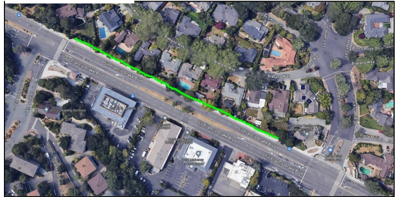
Project area end near La Questa