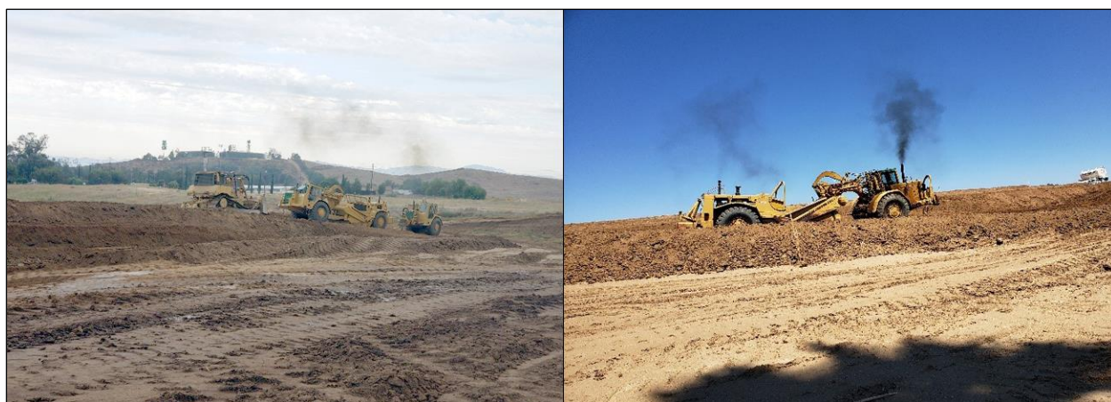
Figure 4. Earth-moving operations in the project area. Left : crews working on a stockpile (view to the southwest, photograph taken on August 6, 2019); right : grading along the slope of the hill (view to the northwest, photograph taken on August 12, 2019).

No paleontological resources, including small fossils in the sifted soils, were discovered throughout the course of the monitoring program. On August 16, 2019, after confirming with the grading contractor that all additional earth-moving activities would only be in areas of fill material that had already been monitored, it was determined that field monitoring for the project was no longer required.