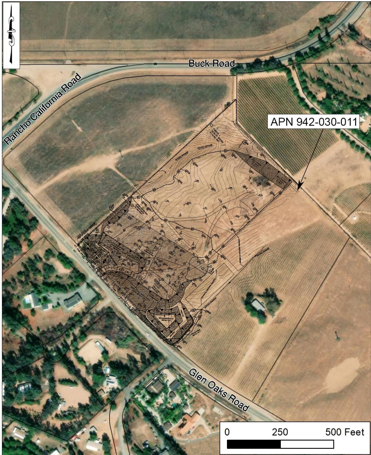
Figure 2. Recent aerial image showing the areas being developed within APN 942-030-011 for the current project.