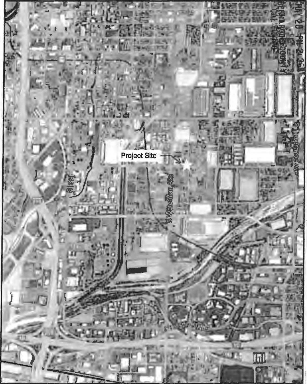
Exhibit 3: Aerial View Amazing 34 Distribution Center City of San Bernardino