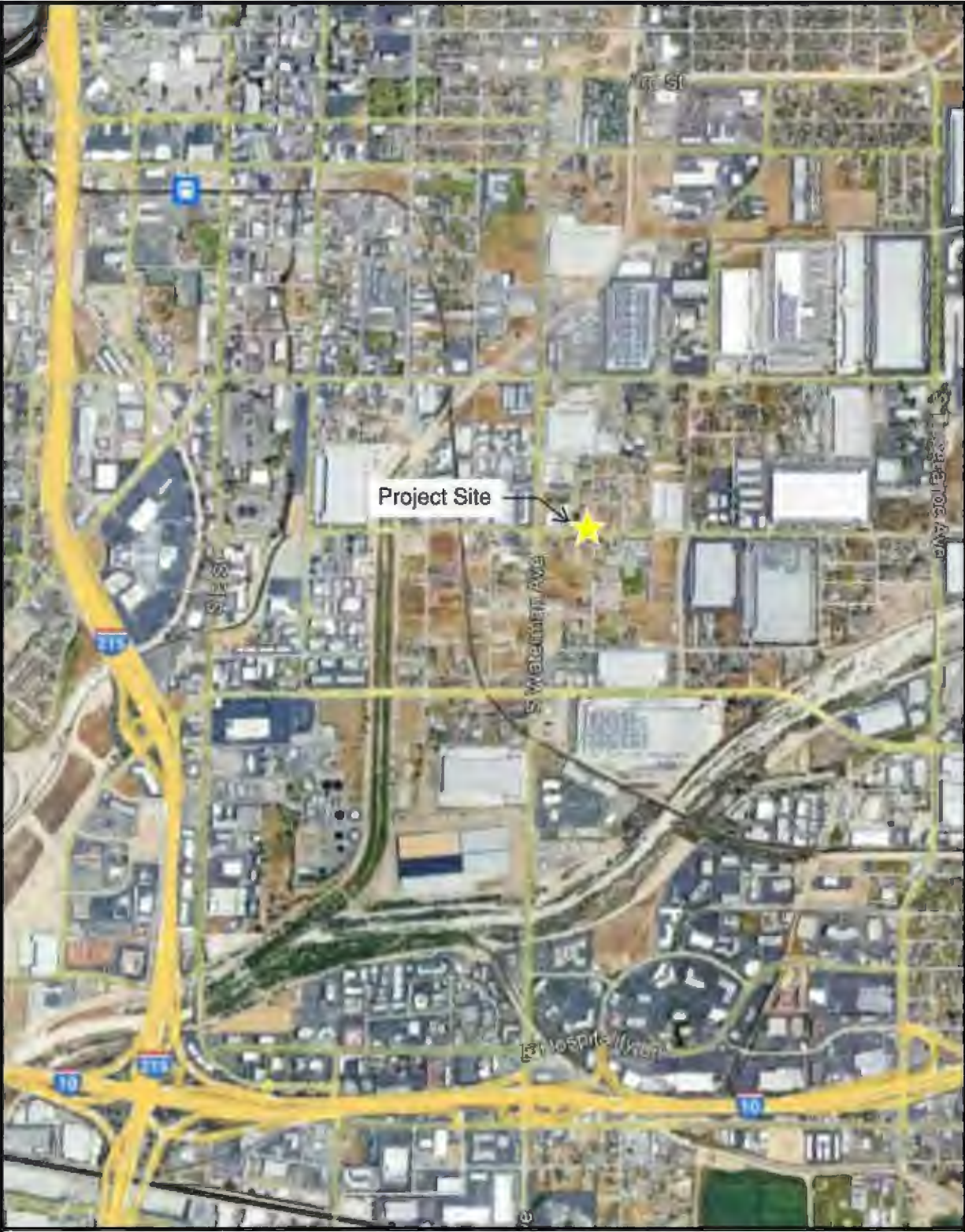
Exhibit 3: Aerial View Amazing 34 Distribution Center City of San Bernardino