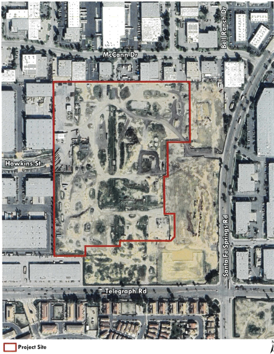
Figure 2: Aerial View