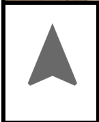
Figure 2: Vicinity Exhibit