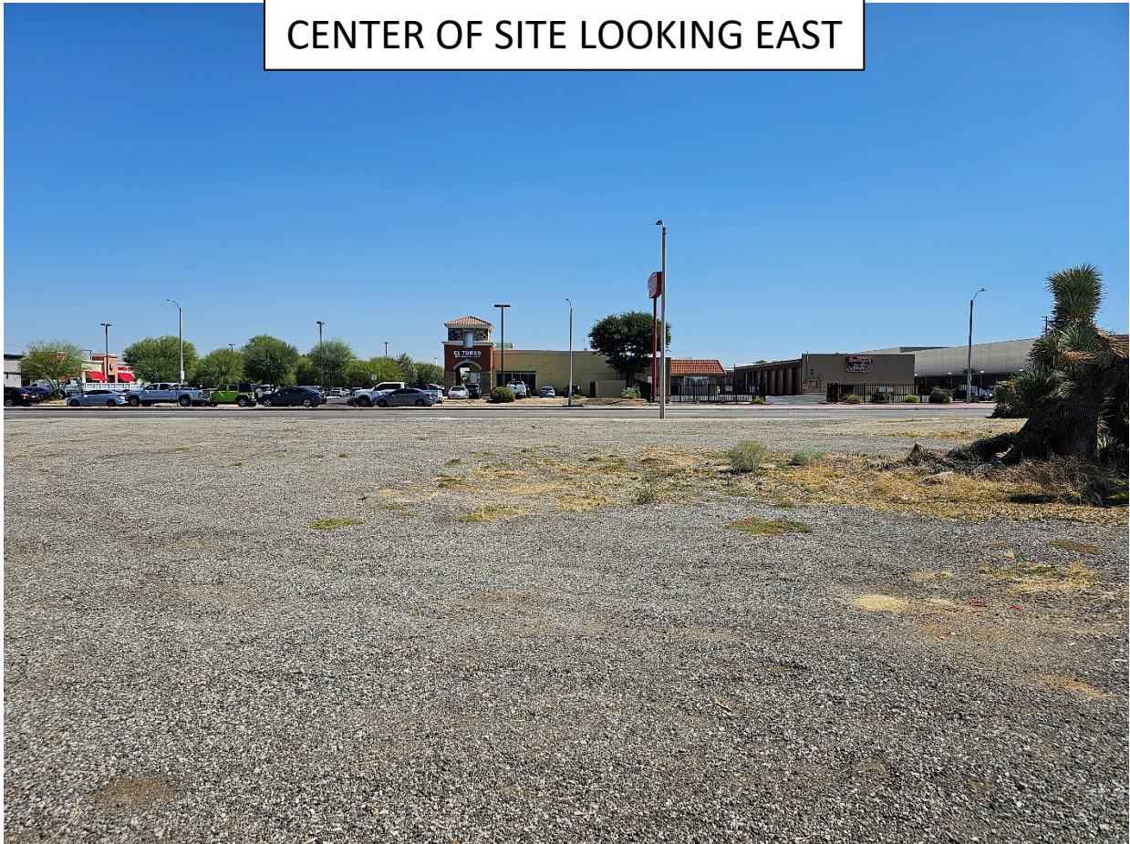
FIGURE 3: PHOTOGRAPHS OF SITE