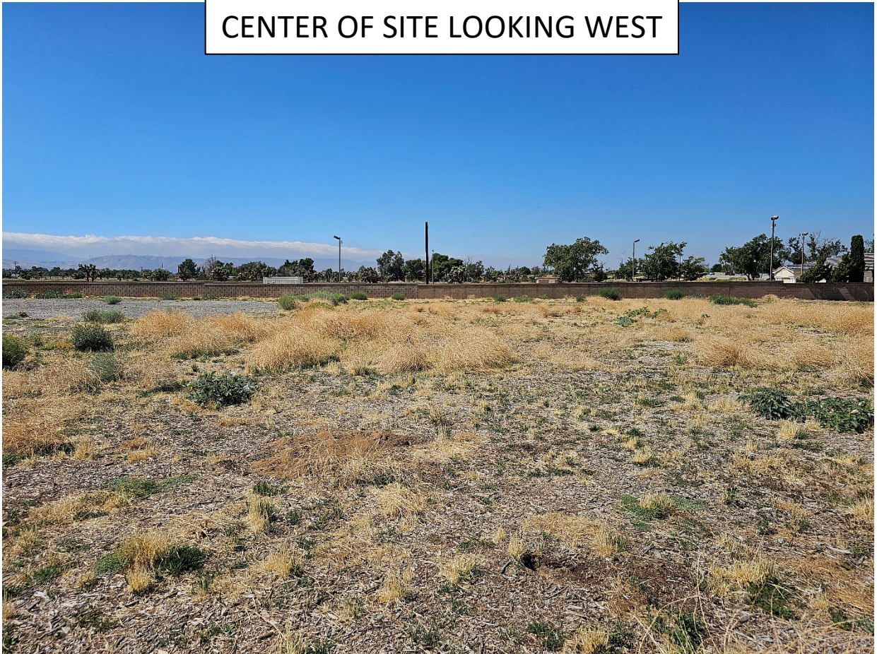
FIGURE 3, cont: PHOTOGRAPHS OF SITE