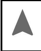
Figure 1: Regional Exhibit