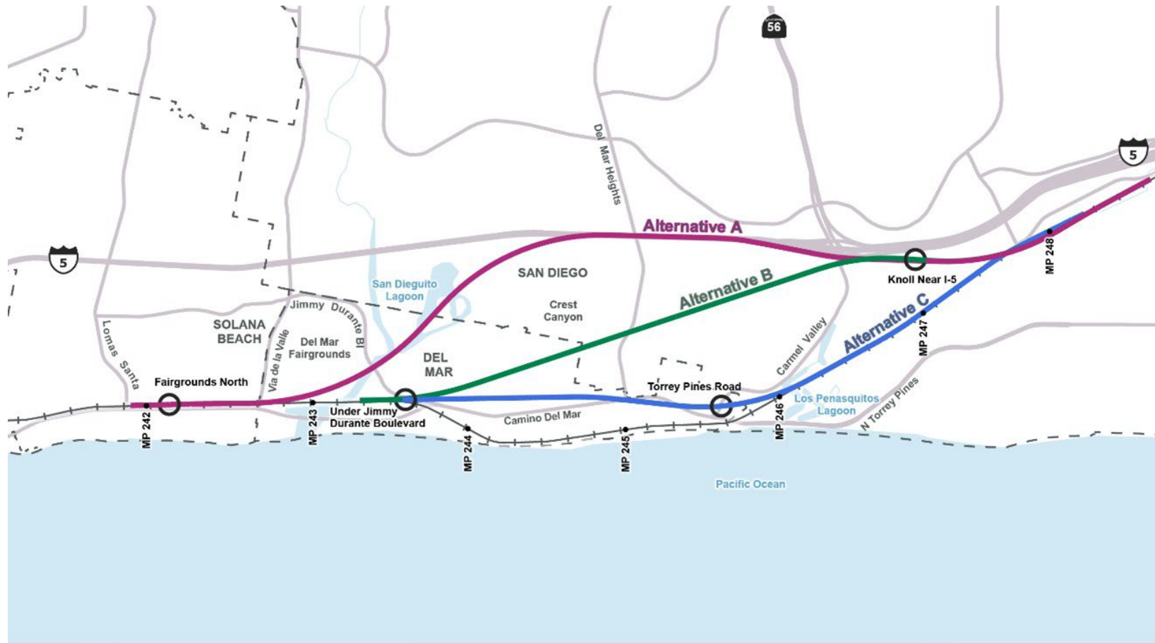
Figure 3. Three Project Alternatives