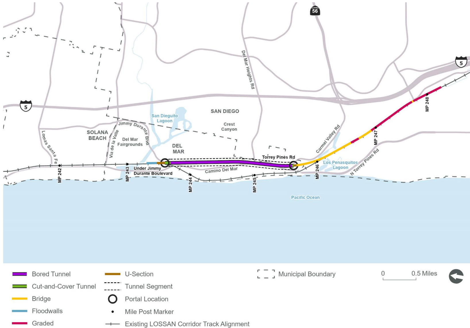
Figure 6. Alternative C Camino del Mar Alignment