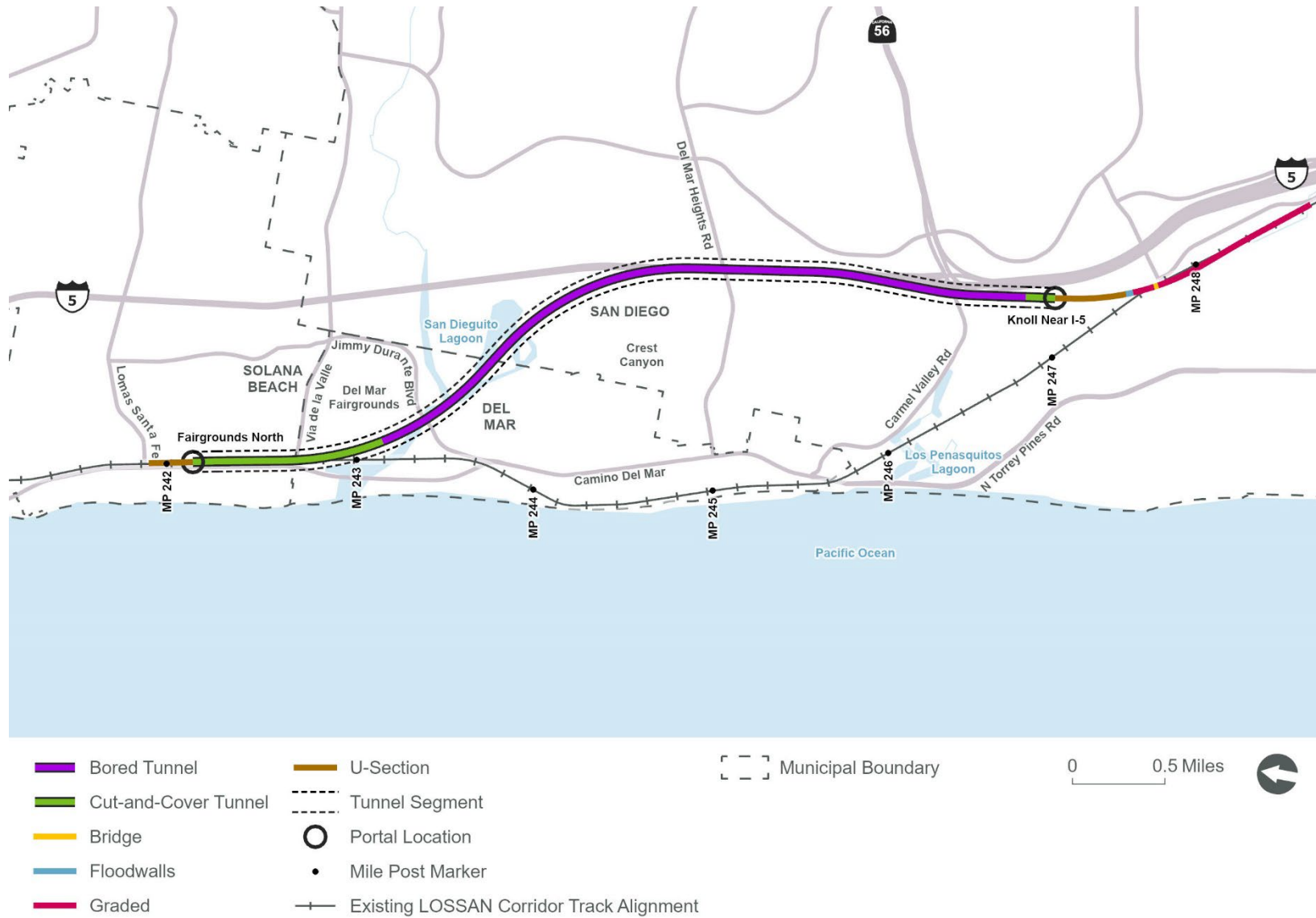
Figure 4. Alternative A I-5 Alignment