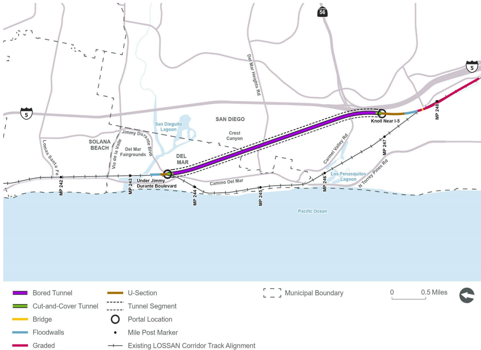
Figure 5. Alternative B Crest Canyon Alignment