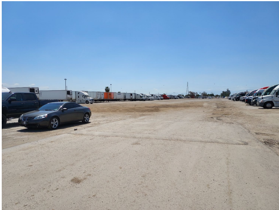
Figure 3 Project Area, Paved Parking Lot, View to the South