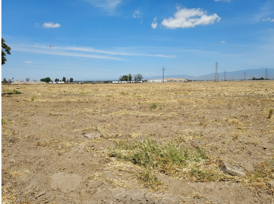
Figure 2 Project Area, former agricultural field at south end of the property, View to the Northeast