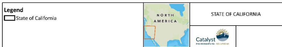
Figure 1. The State of California