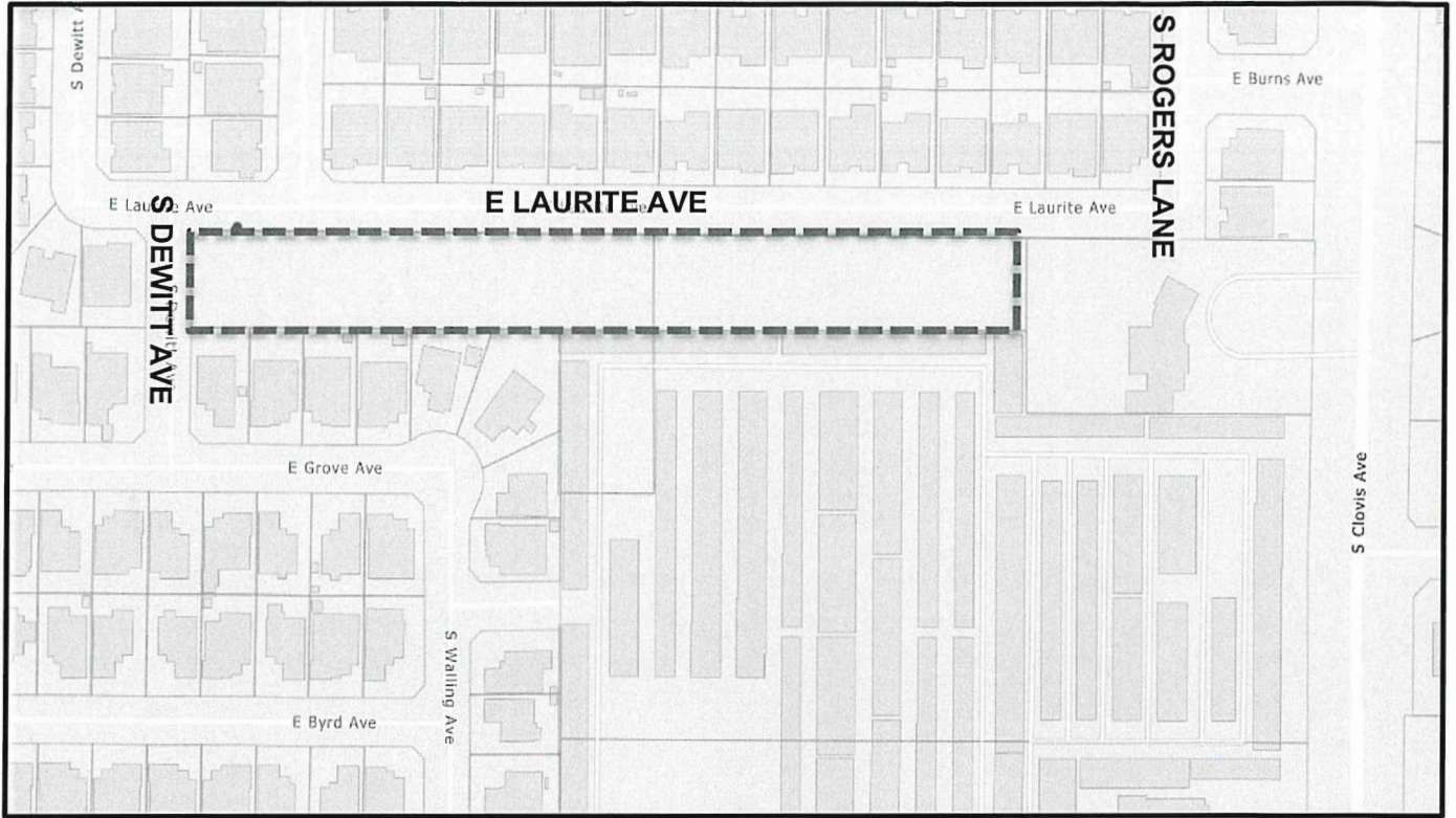
Exhibit A – Vicinity Map