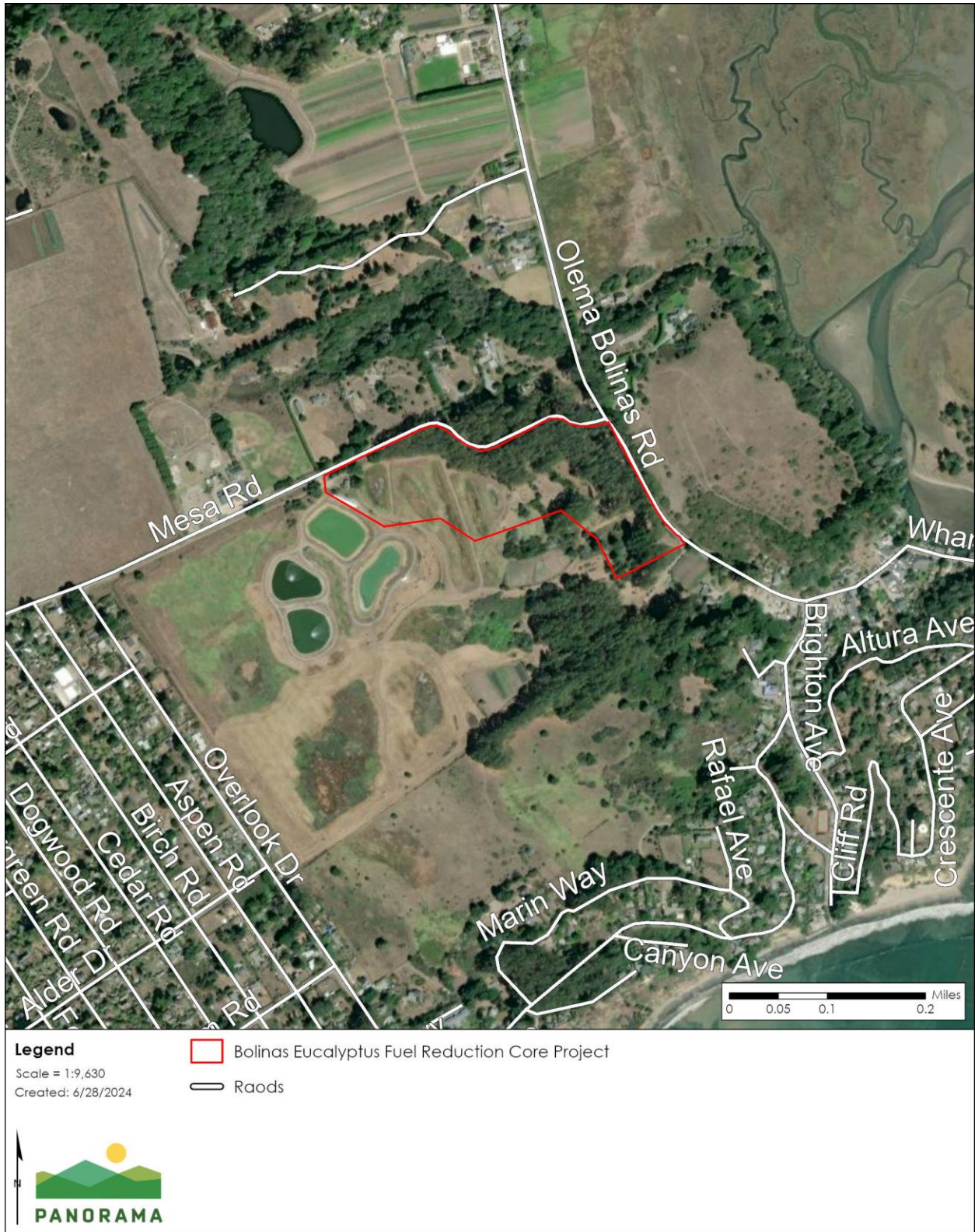
Figure 1 Project Location