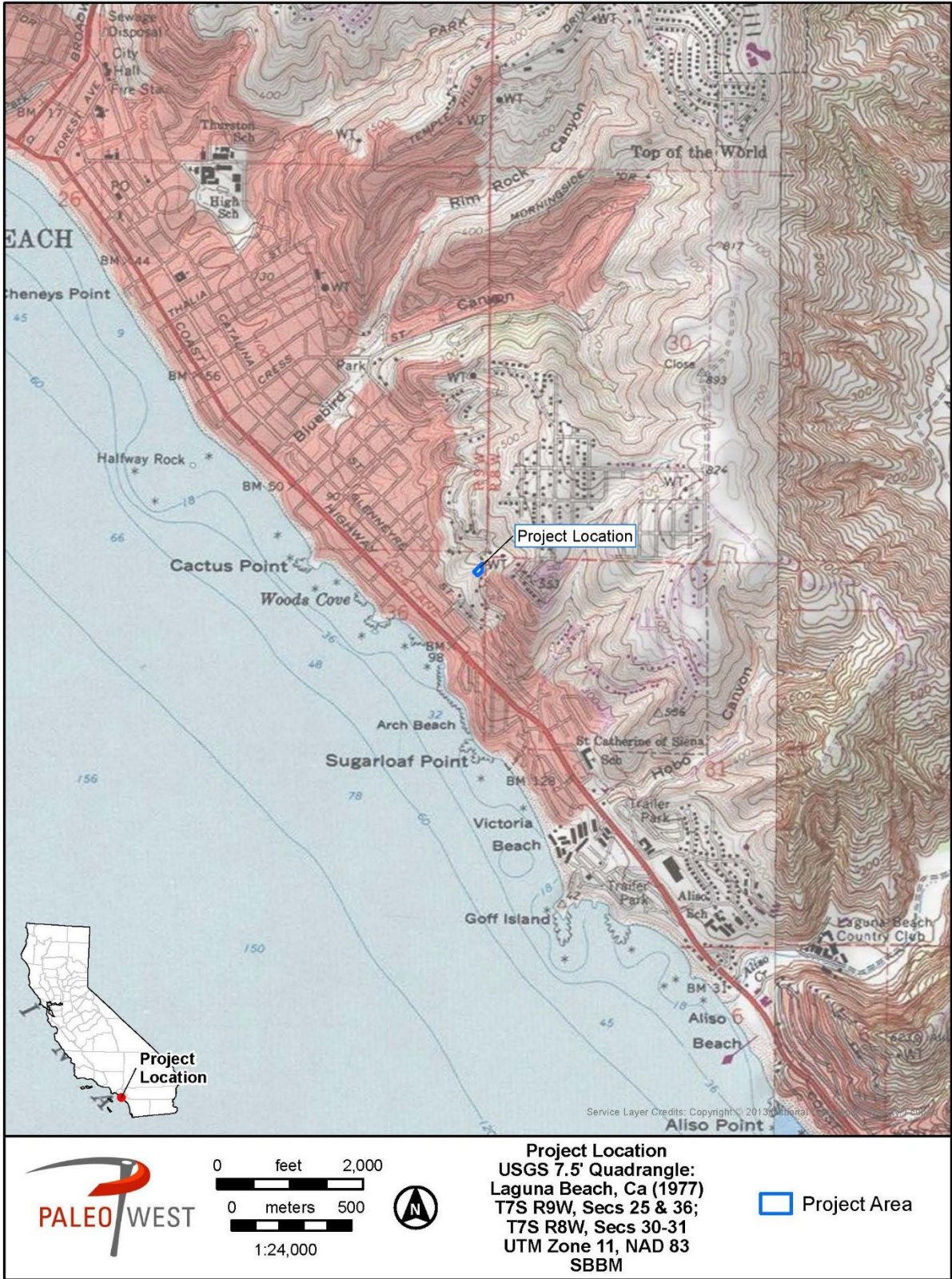
Figure 2. Project location map