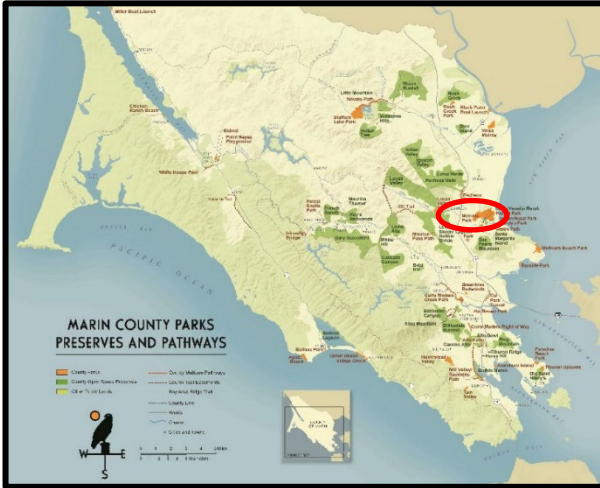
McInnis Park Regional Location