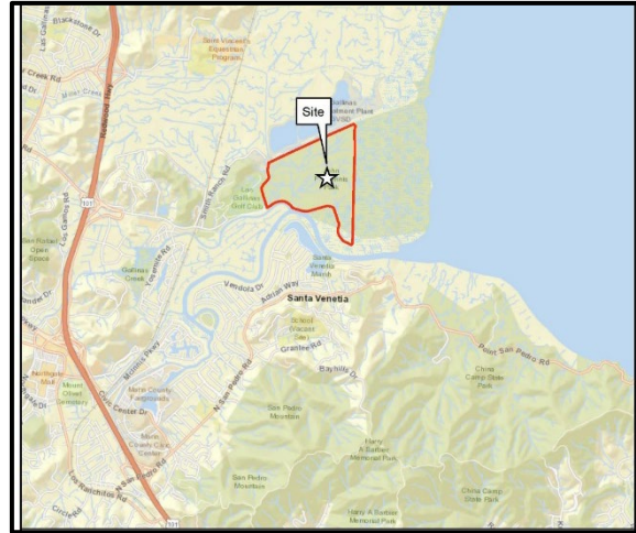
McInnis Park Location