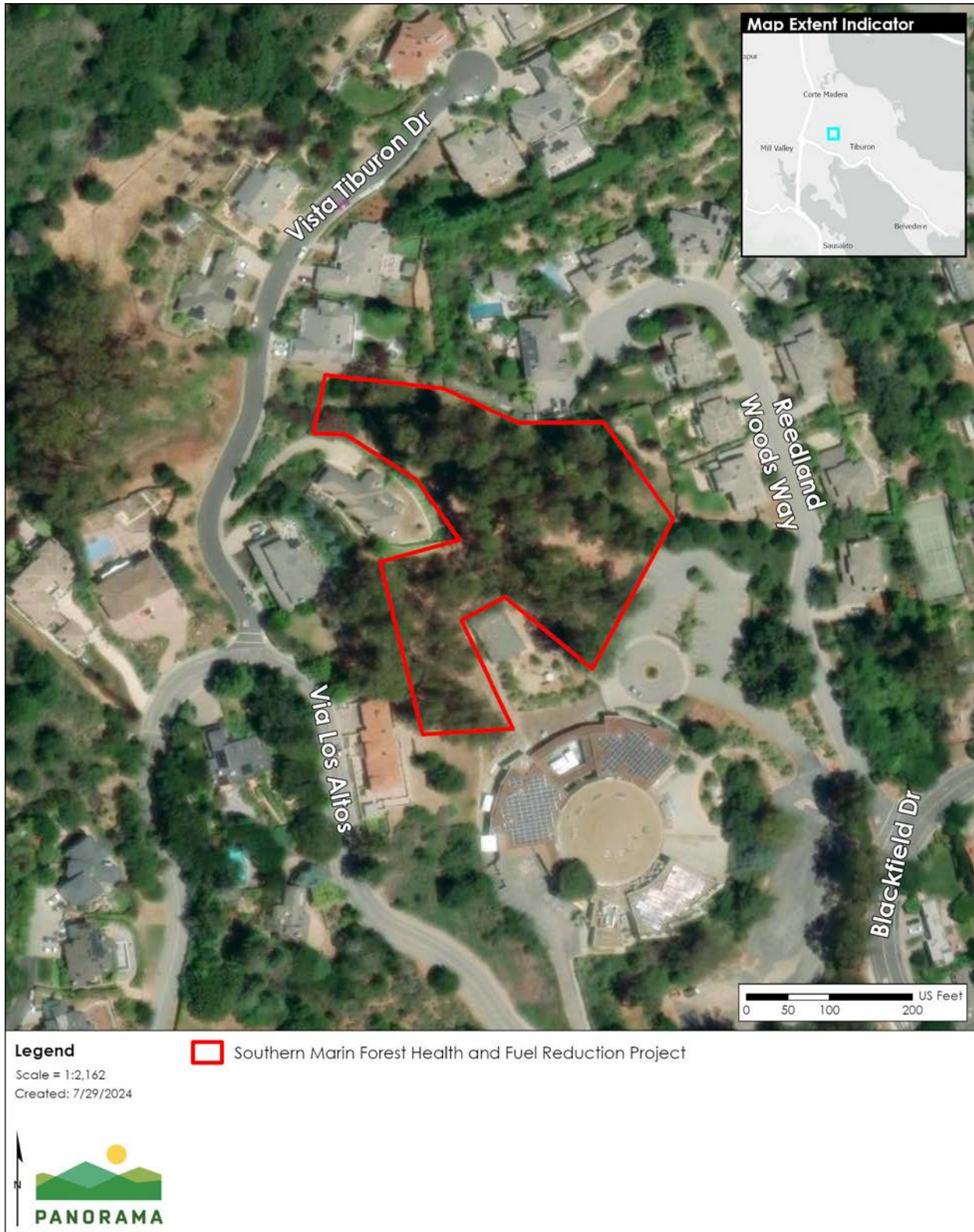
Figure 1 Project Location