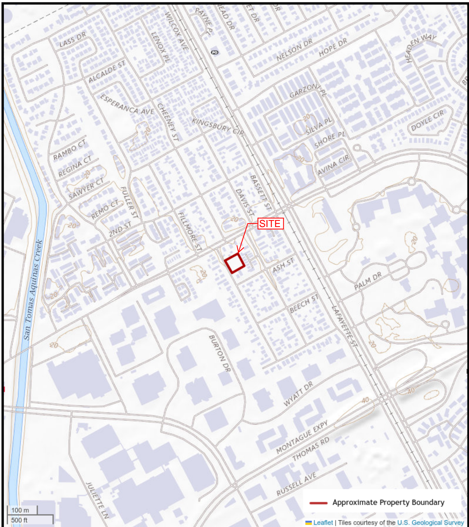
FIGURE 1: SITE LOCATION MAP

Cheeney Street Townhomes, Cheeney Street, Santa Clara, California 95054