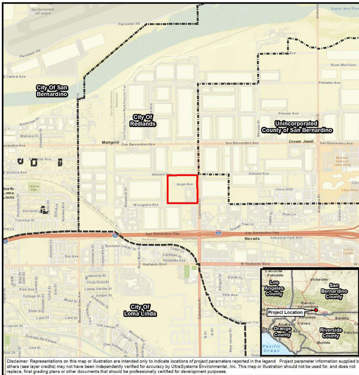
Figure 1 – Project Location