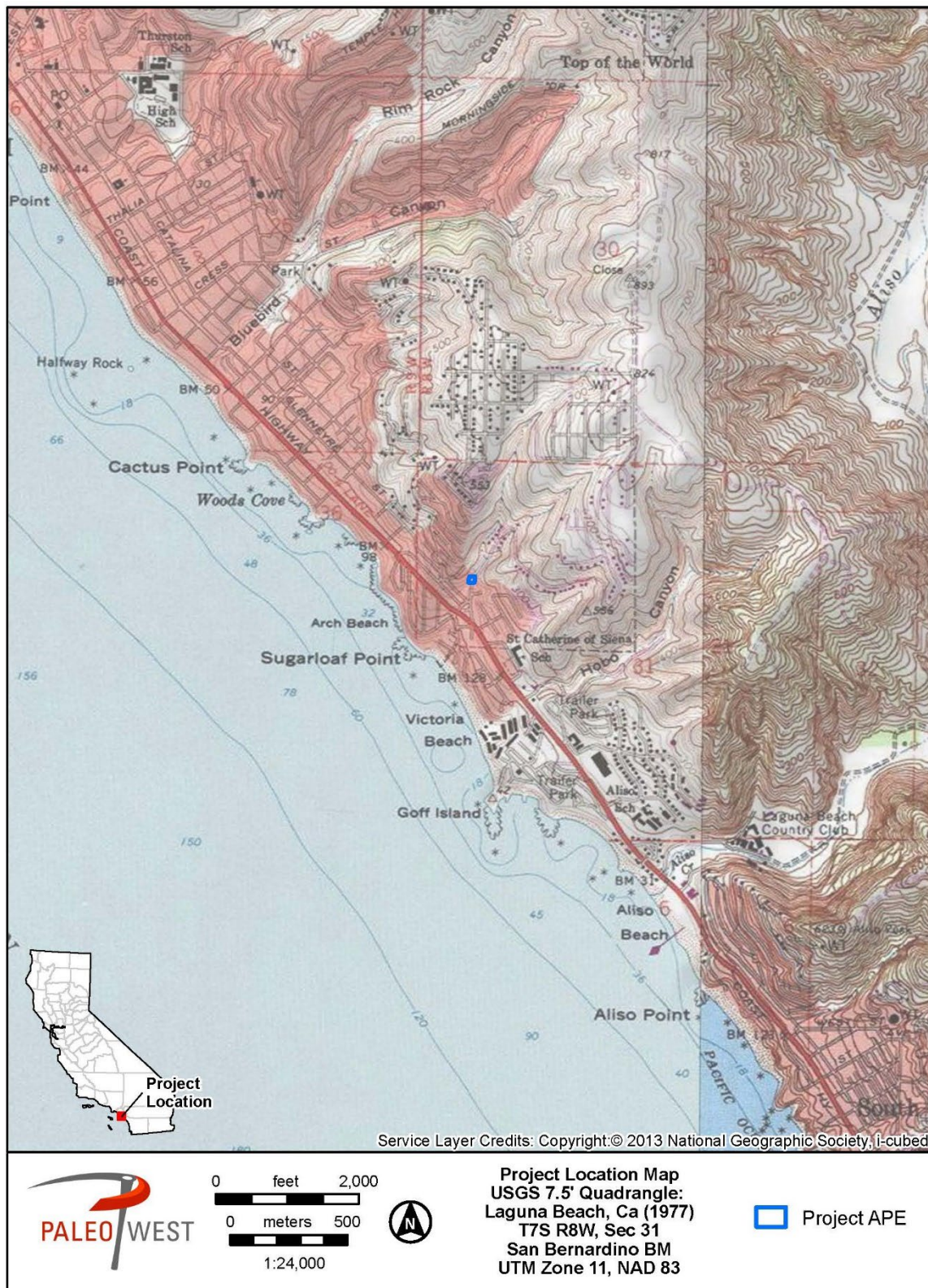
Figure 2. Project location map.