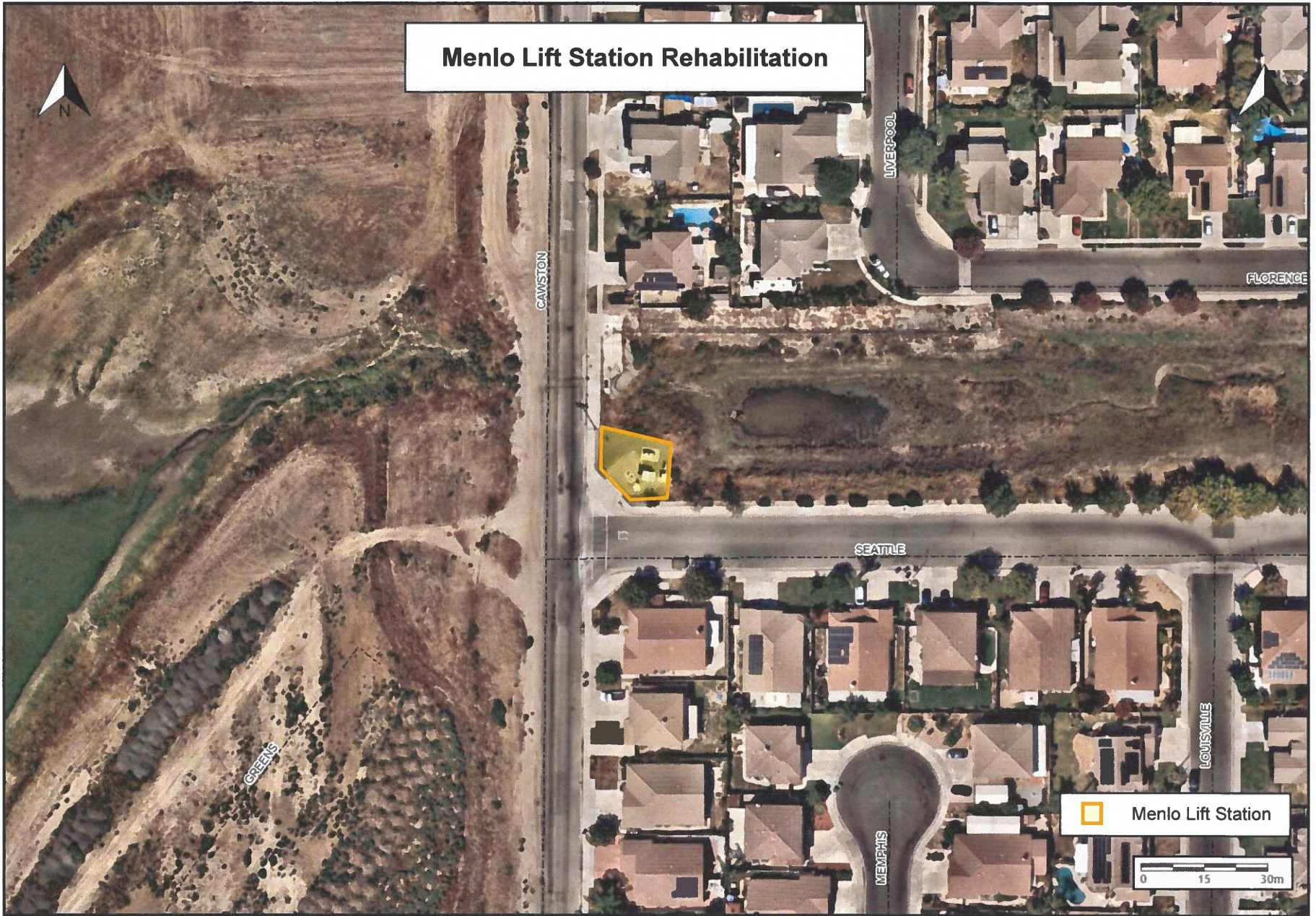
Menlo Lift Station Rehabilitation