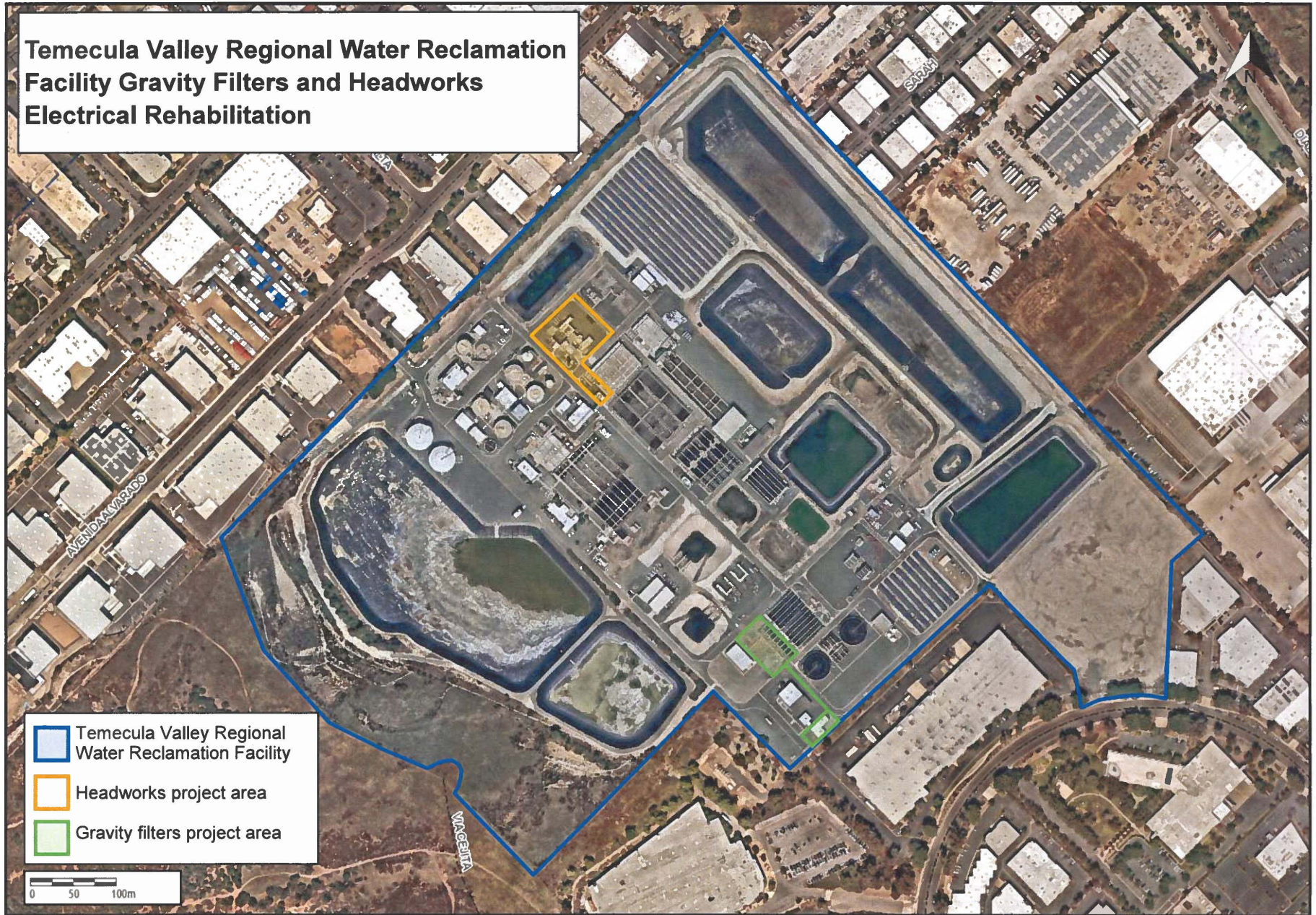
TVRWRF Gravity Filters and Headworks Electrical Rehabilitation