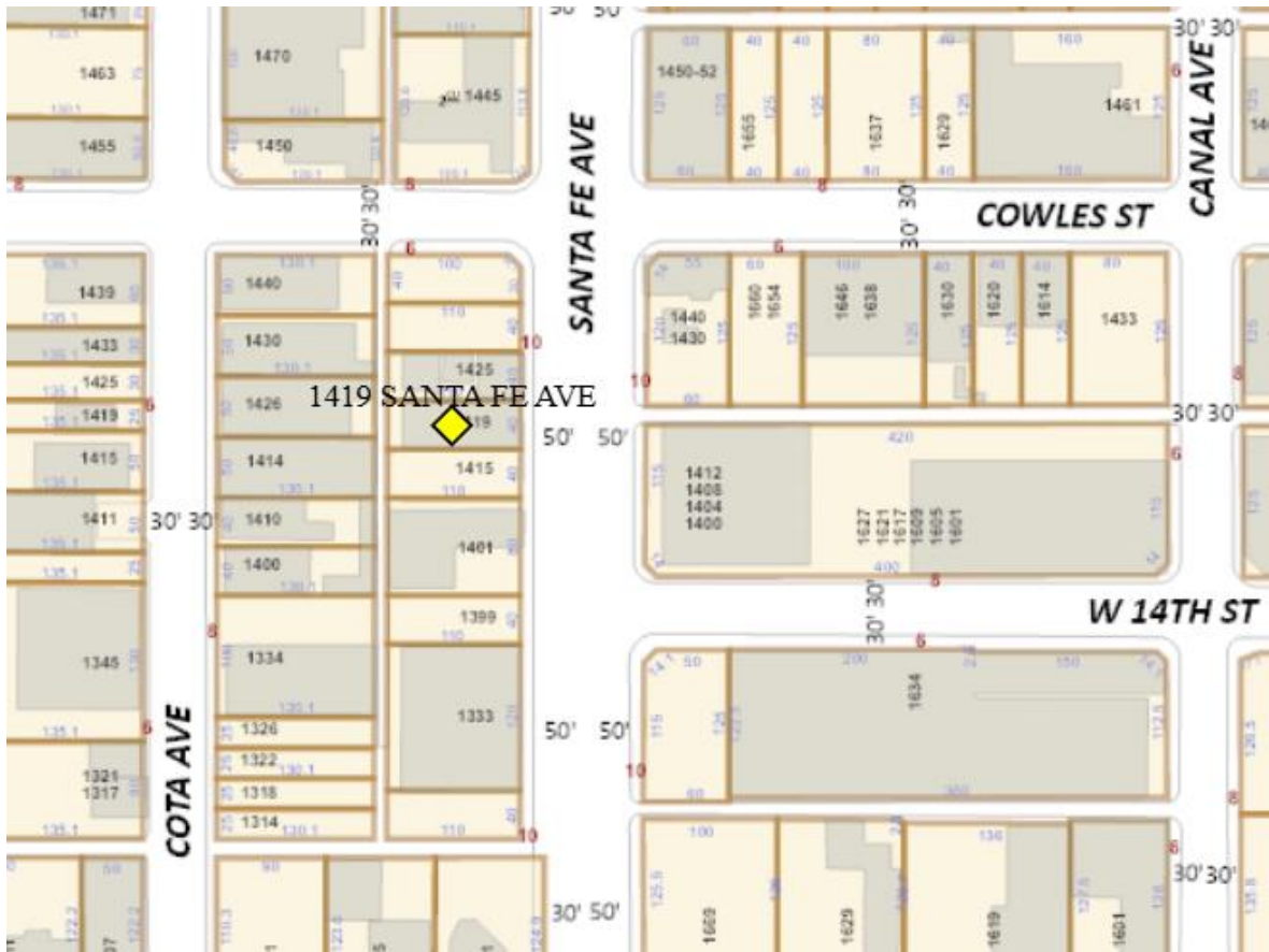
Figure 1 – Vicinity & Aerial Map